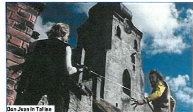
Don Juan in Tallinn