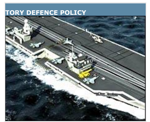
Carry out strategic defence review Look after armed forces "better" Make changes to equipment procurement

There are worries among some former military chiefs that a Conservative government might not be any more generous on defence spending than the current administration.