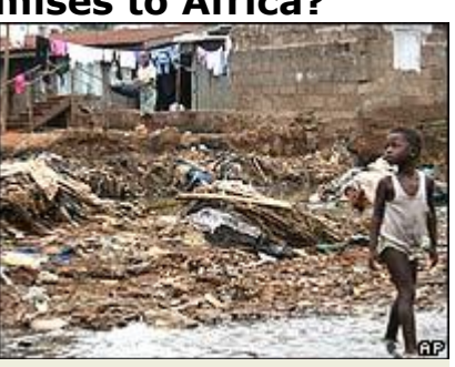
Did the West deliver its promises?