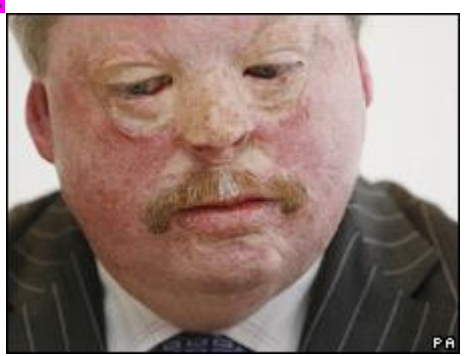
Falklands veteran Simon Weston has advised the Tories

circumvent MoD bureaucracy to order equipment needed urgently in theatre.