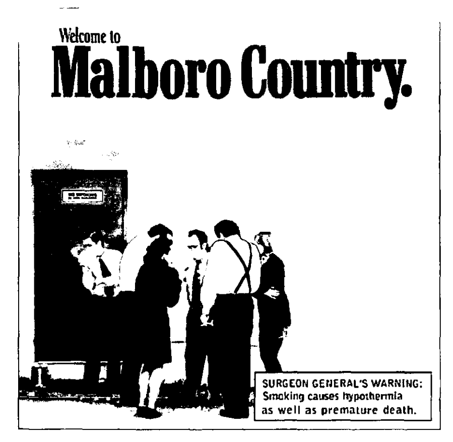
Plate 4 Restyled advert

Like graffiti, jamming can be achieved with little more than a marker pen and a critical imagination to rework advertising copy that can exploit "our common mental environment with the promotion of... desire-mongering" <a href="http://negativland.com">http://negativland.com</a> accessed 20/05/04, or, it can also be technically executed to look like the real thing, only with a twist.