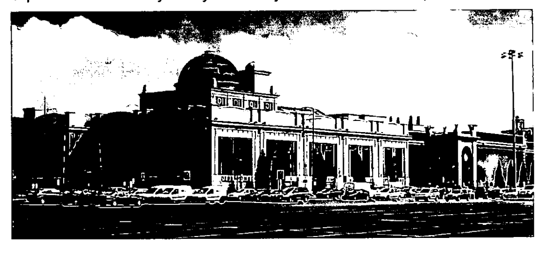
Plate 2 The Trafford Centre

the findings of a market research survey designed to pinpoint the socioeconomic/cultural groupings of its visitors. These reveal that there was an above average quota of people from categories defined as; "suburban semis, stylish singles, mortgaged families, town houses and flats, [and] high income families (T. C. Information Pack 2001, 45). There is nothing intrinsically wrong with catering to a target audience, but, "standardized consumption and entertainment... predicated on middle-class lifestyles" (Valentine 2001, 230) overlooks specific sectors of society. The practices of the mall have the potential to alienate some social groups whilst giving priority to others. Thus, whilst the Trafford Centre sees itself as analogous to "a walled town" (T.C. Information Pack 2001, 4), it could simultaneously be considered a contributor to a new style of democracy; expressed in the ability to buy into lifestyle choices and their spatial attributes.