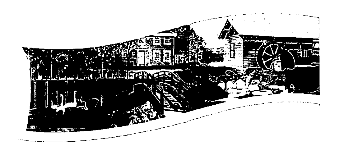
Plate 1 Cypress Point advertising image

Prospective home owners are offered proximity to the town centre but also the idyll of nature tamed and recreated. Individualised housing and a Japanese garden, which is only for residents use, are juxtaposed with signifiers of earlier, more community oriented living such as some of the housing being set around a village green. In promoting itself as a place of otherness while simultaneously using familiar terms and forms, Cypress Point fulfils the heterotopic construct through being able,