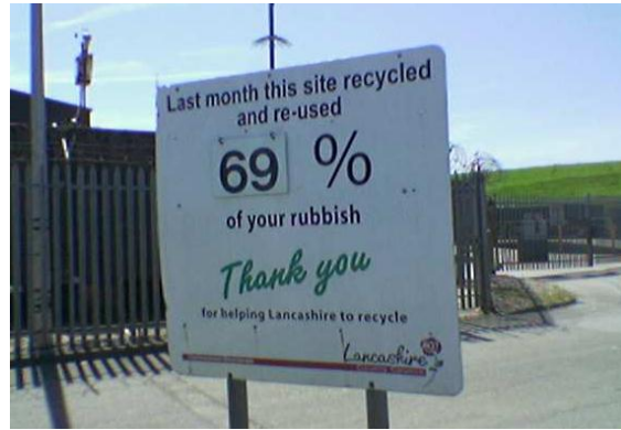
Figure 3. Photographs taken by a boy on a visit to the council tip.