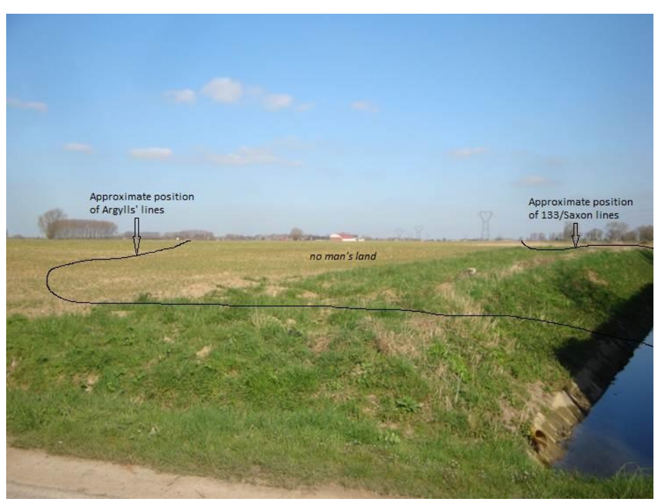
Figure 4 View from Pont ballot towards Hobbs Farm. Author's photograph, 16 March 2014

was reconnoitred by Lieut. Anderson. The Germans asked for leave to bury 10 dead. This was granted. ^{42}