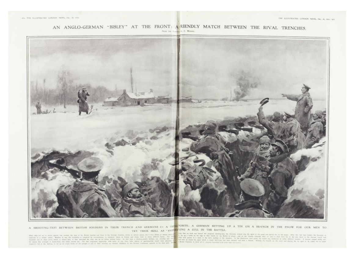
Figure 1 An Anglo-German Bisley by A.C. Michael. ILN 26 December 1915

Fraternisation was being reported in the press and led to hopes for a formal armistice over Christmas (Figure 1). Although this image was published in The Illustrated London News ( ILN ) on December 26, 1914 it must have been 'worked up' well before Christmas. Writing on December 18 ILN columnist Charles Lowe