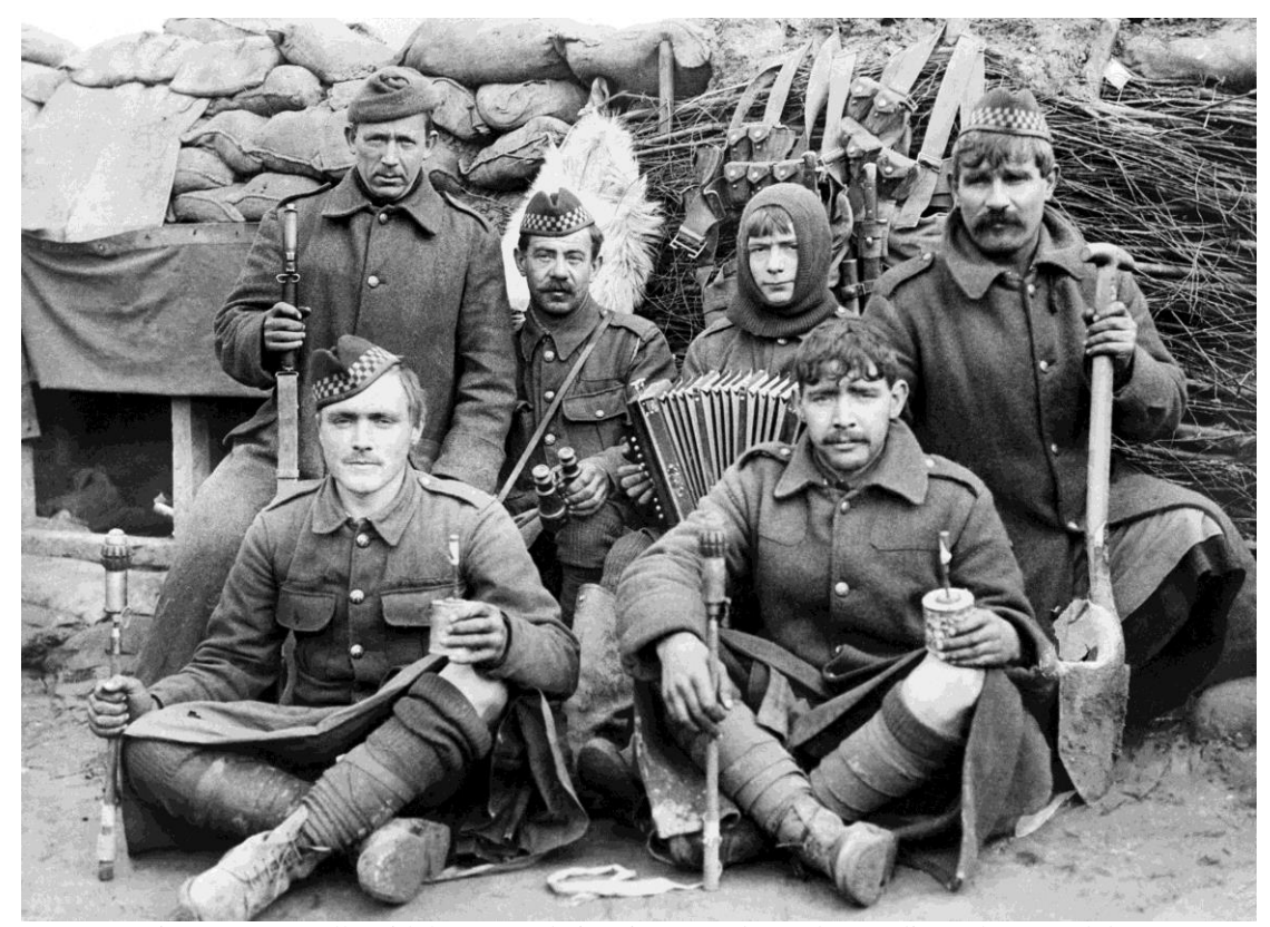
Figure 6 2/Argylls with home-made jam jar grenades and accordion. Photograph by Capt. A. Bankier. ©Imperial War Museum (Q 48958)

footballs into the trenches after their officers objected to their plan of dribbling the balls forward in the charge.<sup>73</sup> Modern analysts forget that the balls of the time did not have valves requiring special inflating needles; they could be blown up by mouth.