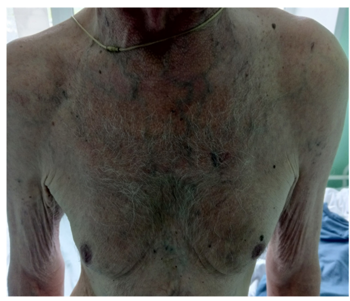
Fig. 2. Engorged blood vessels on the chest.