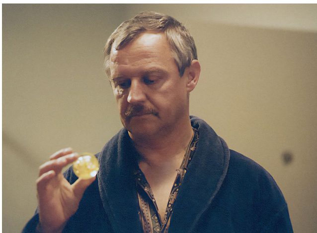
Figure 3. Day of the Wacko (2002), dir. Marek Koterski.

of people voting in this poll, unlike the films of the 1960s, with which many of them grew up. The films from this period were not shown in Polish cinema theatre, except in the specialist Iluzjon cinema, belonging to the film archive and if they were shown on television, they were 'ghettoised' in a special programme W starym kinie/In the Old Cinema , whose very title suggested their outmodedness, unlike films from the late 1950s and the 1960s, which are regularly broadcast on the Polish television, as well as released on DVD.