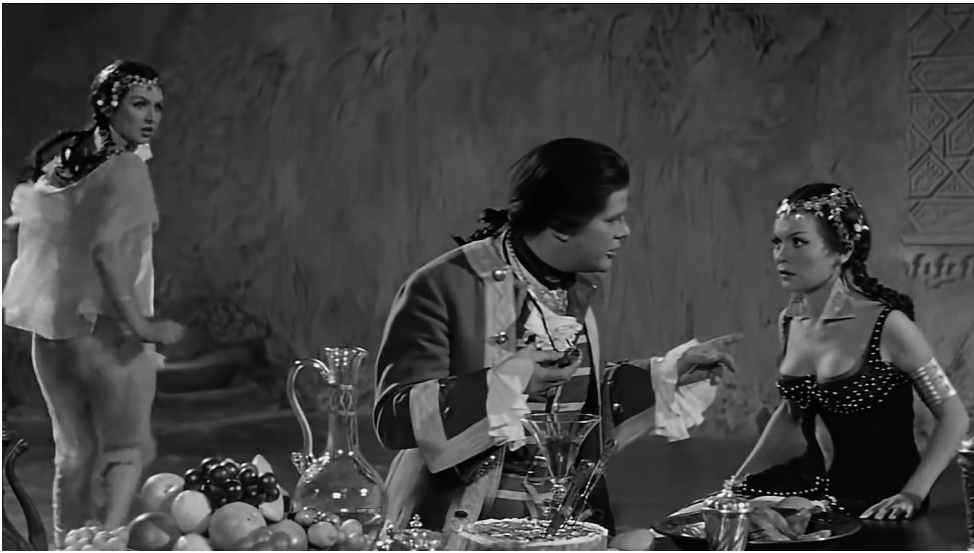
Figure 2. The Saragossa Manuscript (1965), dir. Wojciech Has.

What is also notable about this poll is that it is dominated by the first generation of postwar director-auteurs: Wajda, Has, Kawalerowicz and Polanski. Of the twelve films, eight were made by these four directors, and of those, famous films made in the late 1950s and the early 1960s; what can be described as the films of Polish modernism. What is also striking is the dominance of the films made during the PRL and the lack of films made in the years 1918–1938 among the twelve best or even in the entire list of 100 best films. Why is this the case? Apart from the low reputation of Polish interwar cinema, we can list time as a factor in such a negative assessment – they do not coincide with the ‘lived experience’