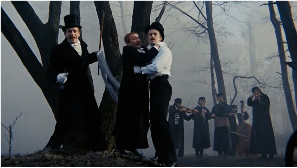
Figure 1. The Promised Land (1975), dir. Andrzej Wajda.