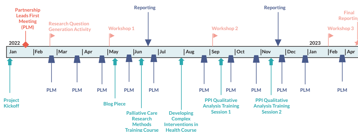
FIGURE 2 Summary of partnership activities.

The stakeholders scored each domain of the research question by using the following scoring system: 0 (unlikely