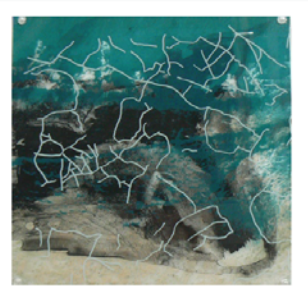
Tracy Hill, 'FootSquare 4', screenprint on acrylic, 12"x12"

Both artists used the project with its ten walks as a source for exploring their personal responses to the landscapes. Discoveries were made regarding how each viewed the 'home landscape' of the other artist. The two printmakers were drawn to similar aspects of the landscapes, often laughing as they photographed parts of the same element of nature during their walks. However, shared experiences became transformed through personal processes, revealing individual and divergent visions of the landscapes.