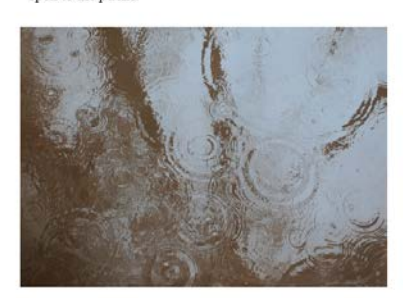
Martha Oatway, 'Dangerfield Island', screenprint, 16.6" x 21"

WPG invites all to 'Field of Vision' on view November 30 -December 31, 2011. An opening reception is scheduled for December 3 from 1-4pm with a gallery talk at 2pm. All of WPG's exhibitions, receptions and gallery talks are free and open to the public.