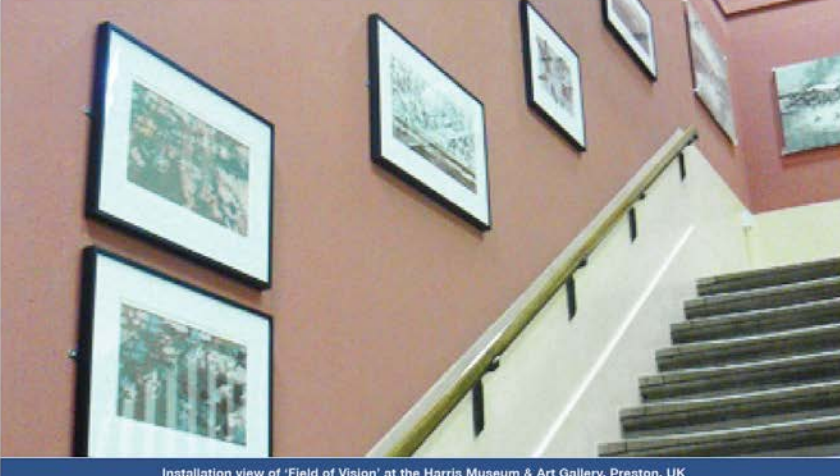
Installation view of 'Field of Vision' at the Harris Museum & Art Gallery, Preston, UK