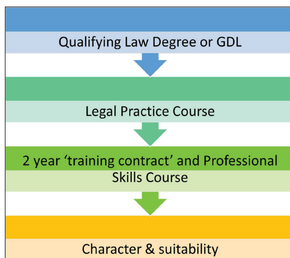
Figure 1. The route to qualification pre-SQE.

Candidates were then required to complete the Professional Skills Course 3 and undertake a two-year Period of Recognized Training (PRT) in the form of a ‘training contract’ which required carrying out both transactional and contentious legal work, under supervision, typically within one law firm.