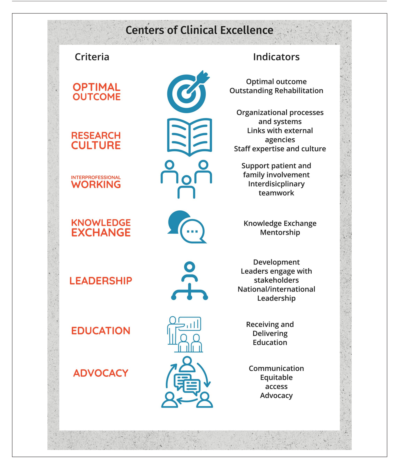
Figure 2. The 7 criteria and summary of measurable indicators for CoCE in stroke recovery and rehabilitation, ranked in order of importance.

excellence. It was recognized that staff should be supported to consider how they work together and how they could