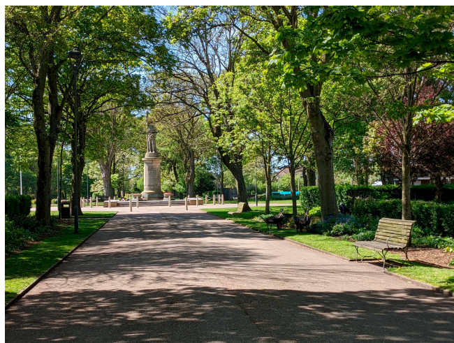
Figure 3. Memorial Park.