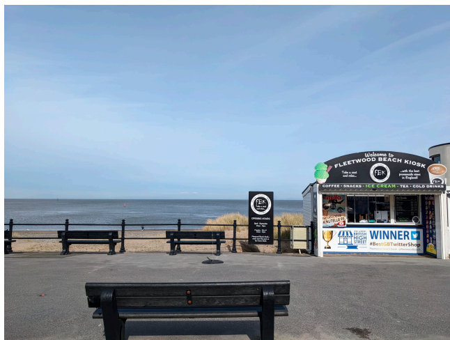
Figure 2. The Promenade.

Being a coastal town, blue space is integral to the town's identity. The town lies behind a sandy beach and shore, with dunes along some stretches. A paved promenade (see Figure 2) runs the length of the town along the sea front and beyond. There are also a number of identifiable public green spaces, including the Memorial Park (see Figure 3), Marine Hall Gardens, and the Euston Gardens.