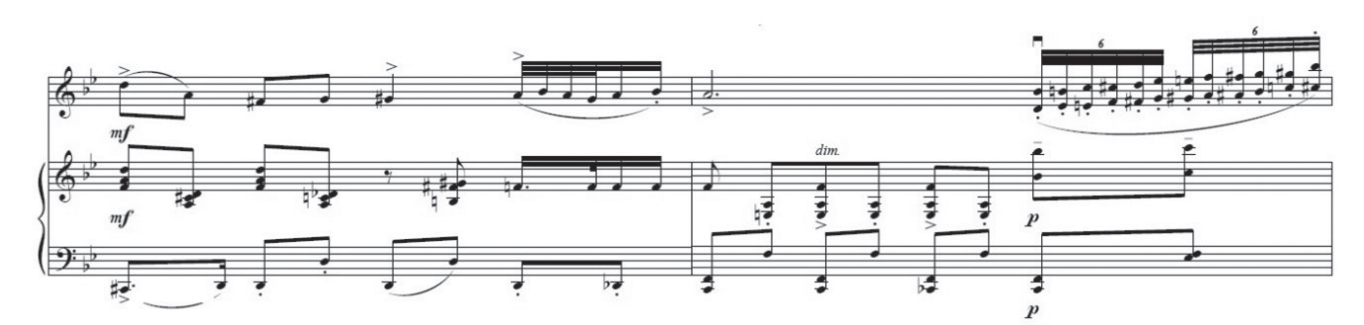
Figure 1: Masques, mm.35-36.

Looking at the score today, one may assume that these were highly technical elements undoubtedly influenced by violin technique and skilfully applied to the viola. For example, in the Masques , the last beat marked downbow 4 measures before the end of the piece with the passage in 12 consecutive double stops of minor sixths written in thirty-second notes covering three octaves. This challenging technique was first introduced by Paganini and becomes highly virtuosic on the viola, especially in such brisk tempo.