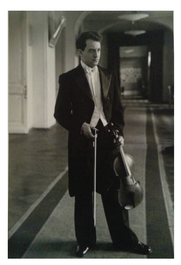
Figure 1: Rudolf Barshai in the foyer of the Bolshoi (Big) Hall of the Moscow Conservatoire with his Granchino viola, 1940s.