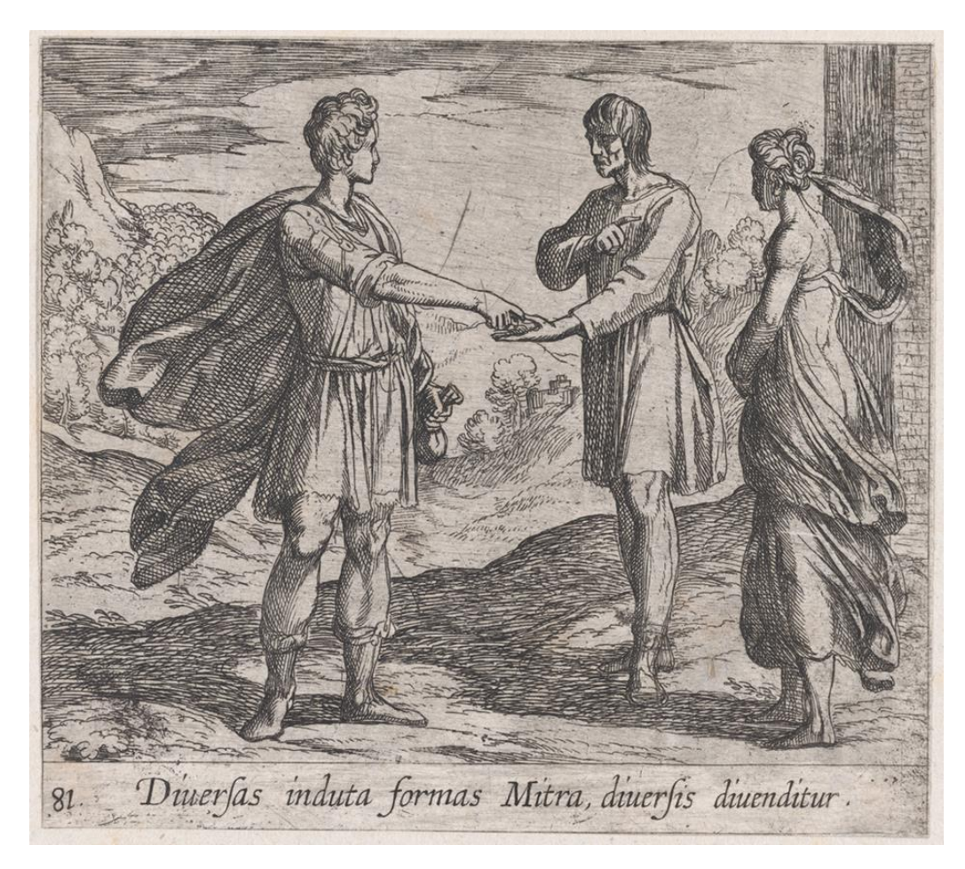
Figure 2. Antonio Tempesta, Plate 81: Erysichthon Selling his Daughter (Diversas induta Mitra diversis divenditur), from Ovid's 'Metamorphoses' 1606, Etching, Dimensions: 103 \times 116 mm).

in resonance (Deleuzian breakdown of genetic conditions of thought, Farockian ideological critique and Rancièrian dialectic of fable and image) to serve the ends of fragmentation and pluralization characteristic of cosmotechnics. These actions disengage the sensory-motor circuit, open a state of intensive variation or crystal image, and bring forth the unevenness of times, which in the context of contemporary art Danh Võ terms estrangement. We identify this model of Simondonian/Deleuzian modulation = individuation as a social process with Maestra, the daughter of Erysichthon. Maestra possessed an ability to shape-shift that Erysichthon exploited. He sold her into enslavement on the assumption she would be able to escape and then repeated the process when she did. In an etching by Antonio Tempesta from a 1606 edition of Ovid's Metamorphoses , we see Erysichthon's pointed finger commanding his daughter (Figure 2). One day she faithfully returned to find her father consuming his own flesh, at which point she took on the form of a hind and left. In a similar manner, living on Earth means unlearning the imperatives of control society, breaking with navigational techno-economic homogenisation, and embracing cosmotechnical becoming as the end of modulation.