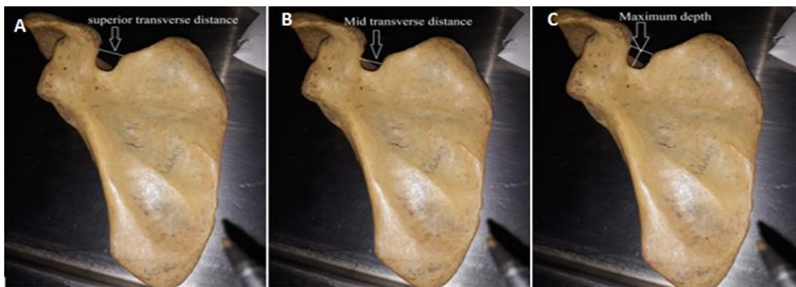
Figure 2: morphometric measurements of the suprascapular notch to assess: A) the superior transverse distance; B) mid transverse distance; C) maximum depth