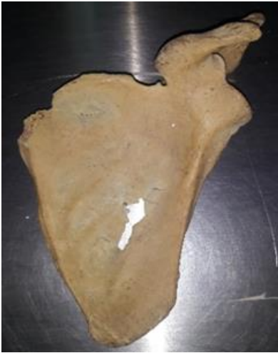
Figure 4: unusual morphology of the suprascapular notch; not fitting in either type of the rengachary classification system