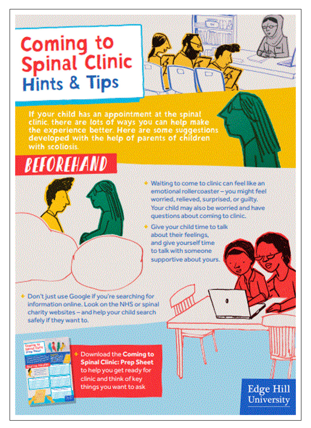
Figure 2. Parent information for 'Coming to Spinal Clinic' 136×195 mm (72 × 72 DPI).