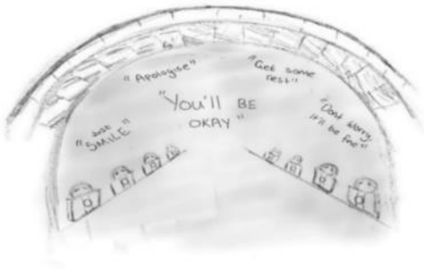
Fig 2: 'Helpful Voices', Ruby, Aged 17 years