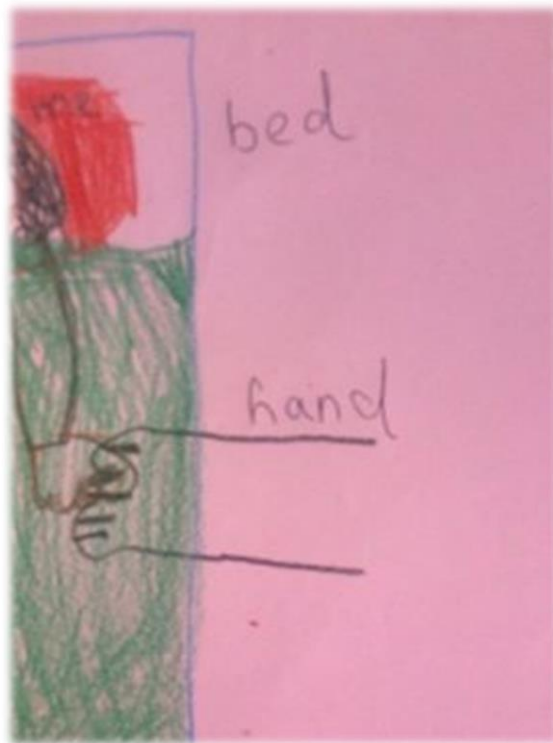
Fig 4: 'I' (Peak Experience Callum, Aged 17 years)