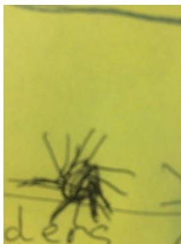
Fig 5: Spiders

Cai: 'when I go toilet, I see people in the water