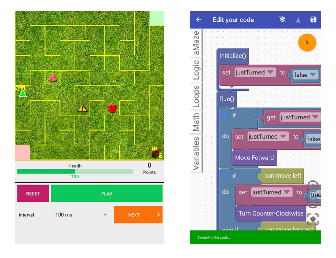
Fig. 1. A screenshot of the aMazeChallenge app: this view shows a maze which includes reward and penalty items (left side), and the Blockly-based code editor (right side).

The mazes are divided into cells, spread on a two-dimensional grid . We use two-dimensional arrays to store the state of each maze challenge, with the minimum size of mazes being 5x5 and the maximum being 30x30. To achieve the behavior needed for a maze, each cell in the grid has a separate state which indicates which of its sides has walls. Cells can have walls in their top, bottom, left and right sides. We implement this using a hexadecimal digit for each cell — for example, the digit E translates to 1110 in binary, which means that the top, bottom and left sides of the cell have walls, while the right side is left open. When a player attempts to move towards the walled side of a cell, their move is automatically rejected and their turn is lost. To avoid this, players can utilize other assistive blocks, such as ' canMoveForward ', ' canMoveLeft ', ' look ', ' getDirection ', to explore their surroundings before making an action. By default, all mazes are outlined with a wall to keep the players from falling off the grid.