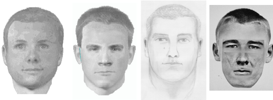
Fig. 1. Composites likeness produced from different systems. All are of the UK footballer, Michael Owen, and were constructed in Frowd et al. [3]. The systems shown here are (from left-to-right) E-FIT, PRO-fit, sketch and Photofit.

given an interview now to assist in the process of building the face: they were asked to describe the face in detail, to assist the police operative to locate suitable features. Computer graphics technology was engaged to allow individual features to be sized and positioned on the face as required, with additional adjustments possible to change feature brightness and contrast. As with the mechanical systems, software editing tools were could further enhance the likeness. There are now many such systems available worldwide, and examples include E-FIT, PRO-fit, Identikit 2000, Mac-A-Mug Pro, ComPhotofit and FACES. Most police forces use one of these modern software systems, or employ the services of a sketch artist, although there are still a few forces that use the older, mechanical systems [4]. Example images produced from some of these systems are shown in Fig. 1.