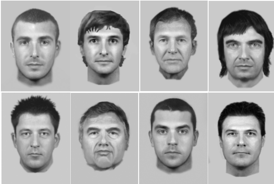
Fig. 5. EvoFITs made from memory, to illustrate the system. From left to right, they are of footballer, David Beckham; actor, David Tennant; former US president, George W. Bush; musician, Noel Gallagher; footballer, John Terry; UK politician Gordon Brown; singer, Robbie Williams; and TV celebrity, Simon Cowell.