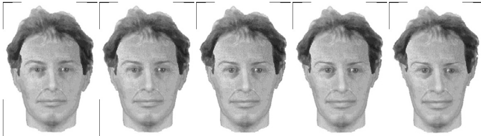
Fig. 2. Positive and negative caricature of a composite of the former UK Prime Minister, Tony Blair. Exaggerations are at (L-to-R) -50, -25, 0 (veridical), +25 and +50% caricature.

A second strand of research has investigated individual differences in the construction and recognition of composites, with the aim improving the recognition of a finished composite. This is an important endeavour, to maximise the chance of composites being correctly named when circulated within a police force or published in the media. The work has identified a number of techniques that can successfully enhance recognition [13]–[15], but one that is the most useful is based on facial caricature [16]. Watching a composite as it is progressively caricatured, where distinctive feature shapes and their inter-relations are exaggerated, and then anti-caricatured, made to appear more average, substantially improves correct naming rates. An example composite caricatured in this way is shown in Fig. 2; in the animation, there are 21 frames rather than the five shown here.