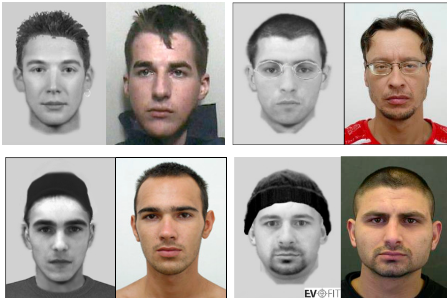
Fig. 6. EvoFITs produced in criminal investigations. The EvoFIT is shown on the left in each pair, while the image on the right is a photograph of the person believed to be responsible for the crime. Images are printed with permission from the relevant police forces.