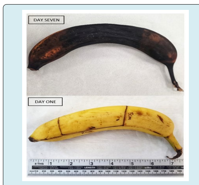
Figure 1: Banana skin was left for five periods (Zero hours, 3 hours, 12 hours, 24 hours and one week) at room (RT) with moderate humidity (20 to 25°C/50%).

for 1 minute. The same procedure was repeated for each