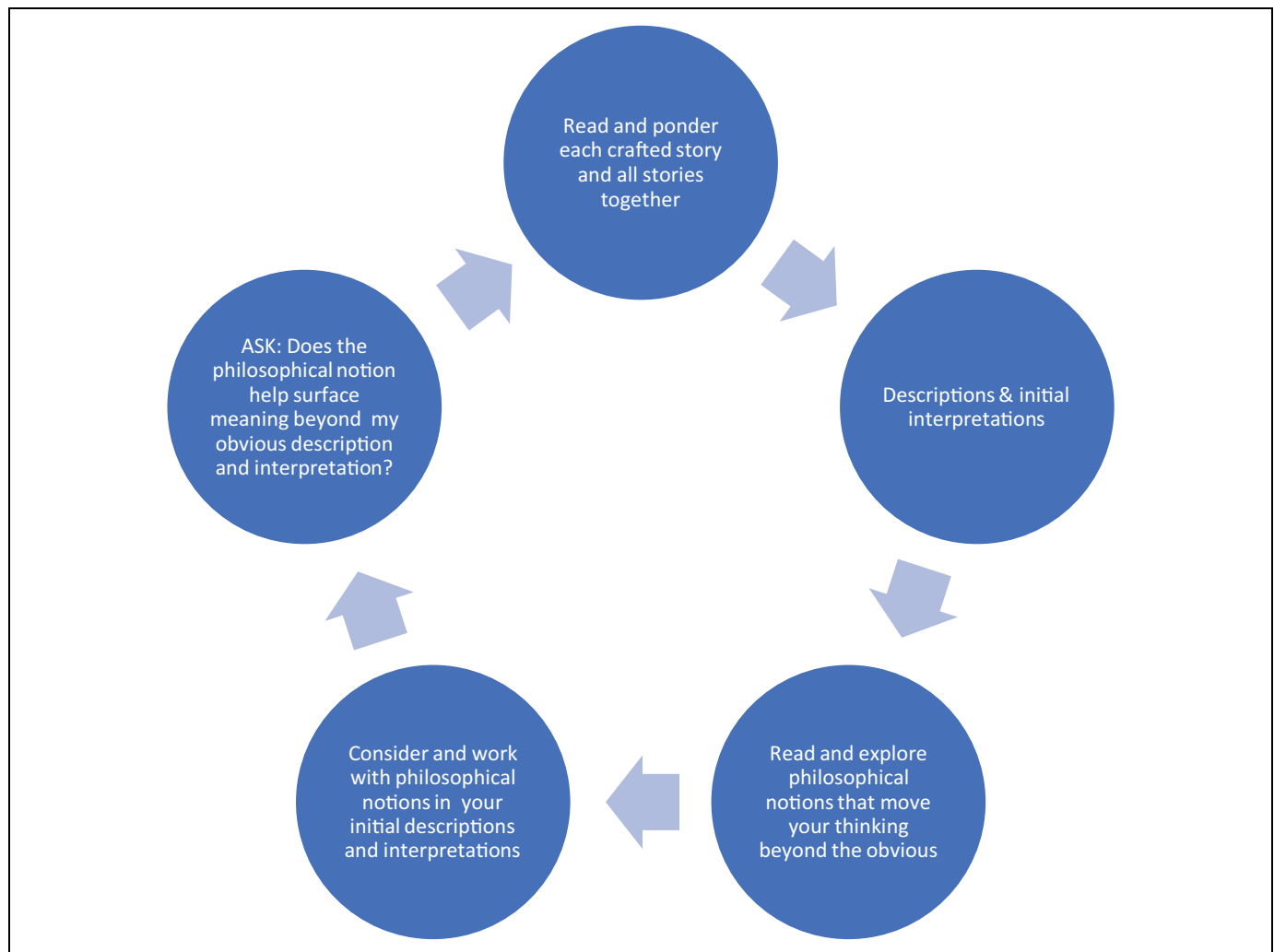
Figure 2. Taking an interpretive leap. Note. This figure builds on Figure 2 providing further pictorial representation of the interpretive process as discussed in the text.

by nature social beings who share a world and exist alongside others, either with those physically near and far to us but also others unseen and voiceless, the “They.” Heidegger (1927/1962, p. 121) also describes different forms of being-with-one-another ( Miteinandersein ) to capture how human beings express concern for each other; with this innate concern referred to as “care” or “solicitude” (1927/1982, p. 121). The first is—“leaping ahead” where concern and actions aim to enhance the possibilities for the “other”: