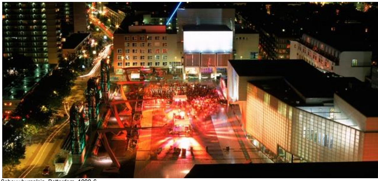
Schouwburgplein, Rotterdam, 1992-6

Perhaps at some stage something like the Schouwburgplein Megacinema in Rotterdam (by Koen Van Velsen and West8, 1992-96, see below) was in an architect's head, and by degree every interesting part of it has been value engineered. You can imagine the conversation: Open forum over the ground floor? - We need to maximise potential retail space. Articulated interior volumes to express individual theatres? - Cheaper if we join them together, one wall instead of two. Projecting upper floors sheltering an outdoor threshold space? - Cantilevers are expensive structures. Discrete cinema with a strong identity? - We need a 350-place car park. Large public events piazza over underground car park? - No thanks. Translucent walls that glow at night? - You must be joking.