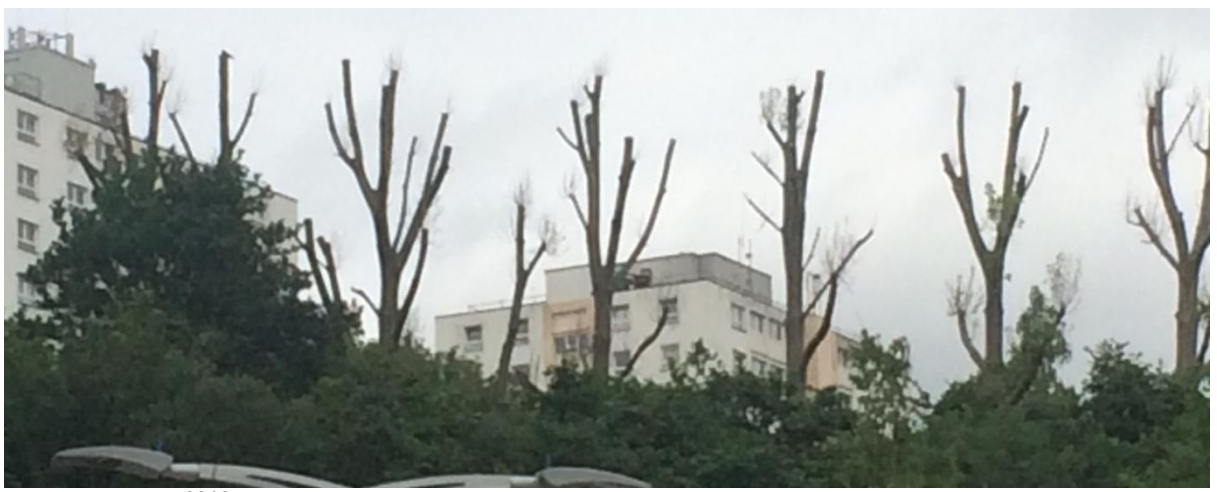
Heaton Norris Park, 2018

The council describes this building as "a game changer for Stockport". (Kate Butler, Manchester Evening News, 24 November 2017). With its short lifespan high embodied energy materiality and unthinking acceptance that users will all drive there, it is more a climate changer. We should rethink our strategies for shrinking towns away from puerile landmarks to more humble urban stitching with housing and mixed use; gradual rather than cataclysmic investment.