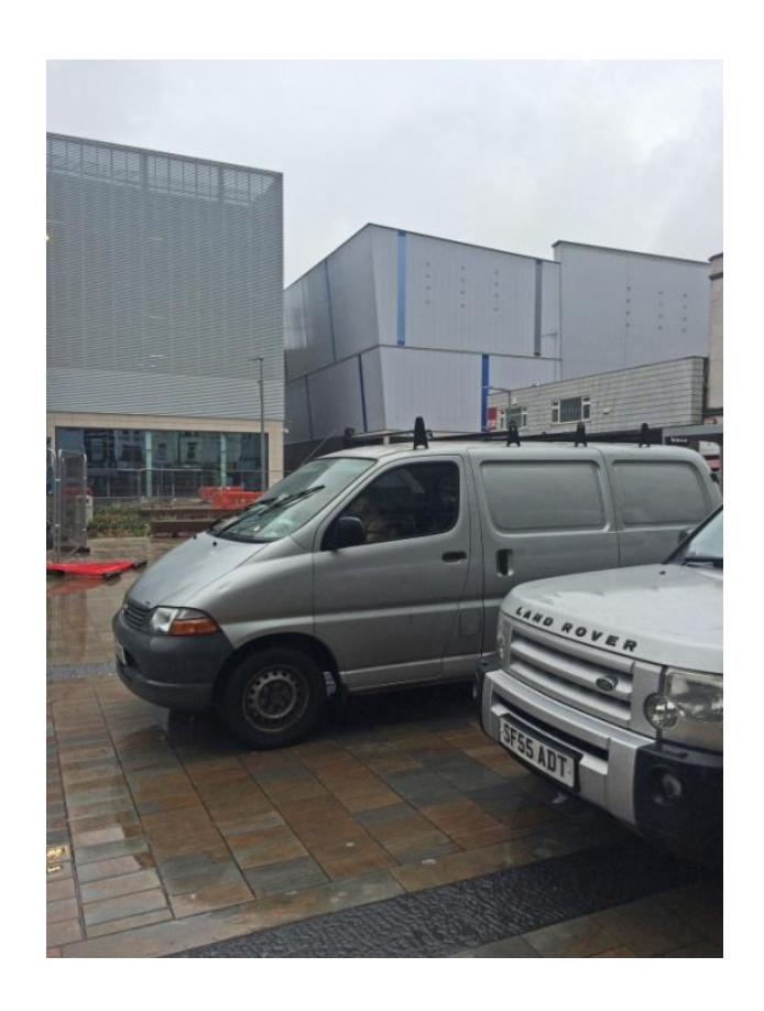
Redrock, Stockport, 2018

Perhaps at some stage something like the Schouwburgplein Megacinema in Rotterdam (by Koen Van Velsen and West8, 1992-96, see below) was in an architect's head, and by degree every interesting part of it has been value engineered. You can imagine the conversation: Open forum over the ground floor? - We need to maximise potential retail space. Articulated interior volumes to express individual theatres? - Cheaper if we join them together, one wall instead of two. Projecting upper floors sheltering an outdoor threshold space? - Cantilevers are expensive structures. Discrete cinema with a strong identity? - We need a 350-place car park. Large public events piazza over underground car park? - No thanks. Translucent walls that glow at night? - You must be joking.