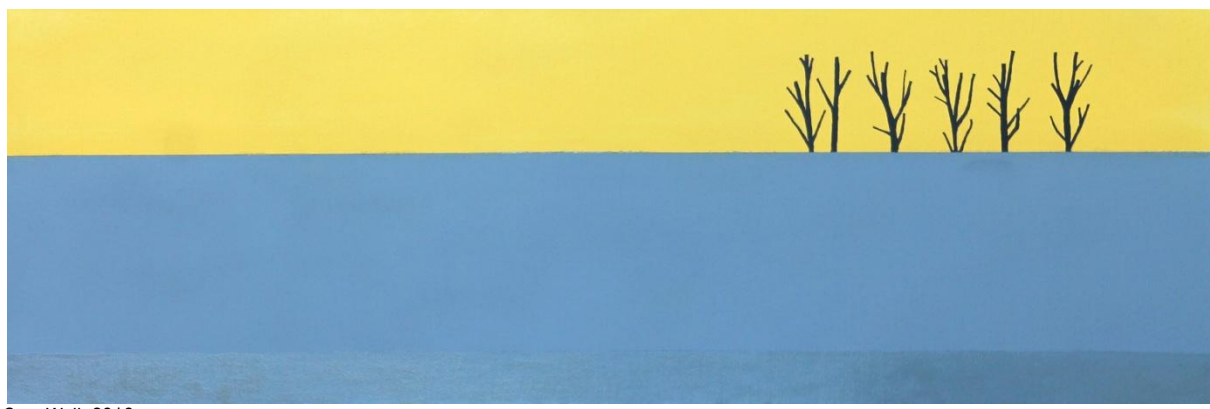
Grey Wall, 2018