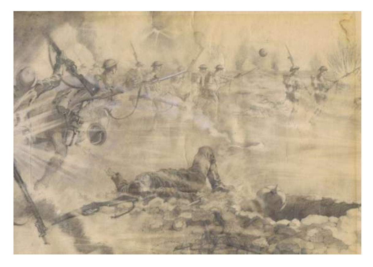
Figure 3. 'The East Surreys' Attack' by Percy Syer.

The two footballs were recovered from the German wire and returned to the regimental depot at Kingston-upon-Thames. The balls were used to raise funds for regimental charities often accompanied by survivors of the charge during the remainder of the war.<sup>44</sup> They eventually became prize museum exhibits, one at Dover Castle and the other at the Surrey Infantry Museum at Clandon Park House, Surrey. Sadly a fire at Clandon Park on the 29 April 2015 destroyed their ball alongside most of the regiment's memorabilia, including Syer's sketch.