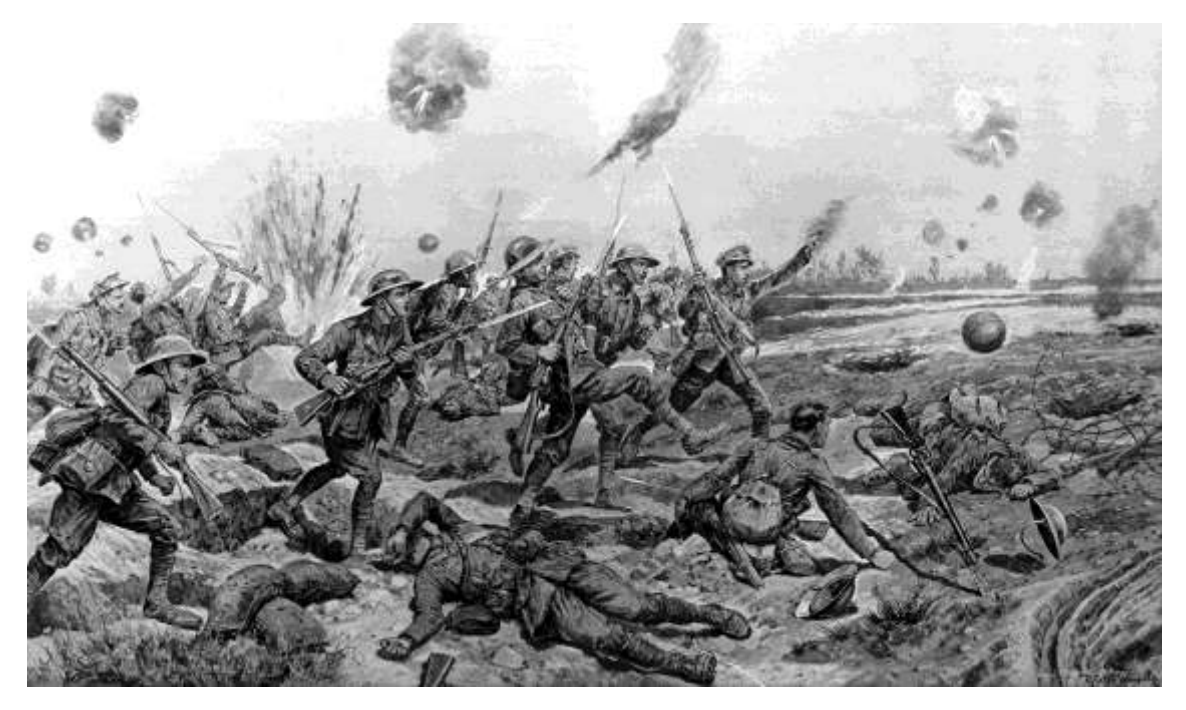
Figure 2. 'The Surreys Play the Game' Illustrated London News , 29 July, 1916, 134-135.

There had been little press coverage of the football charge of the London Irish a year earlier but, following the alarming losses at the Somme, Nevill's enterprise helped divert the nation's attention. It captured the public imagination with a story of heroism and courage that supported the concept of an invincible British sporting spirit. The Illustrated London News (Figure 2) published a double page illustration of the East Surreys attack, 'The Surreys Play the Game', on the 29 July 1916. The script noted 'The Captain of one of the companies had provided four footballs, one for each platoon, urging them to keep up a dribbling competition all the way over the mile and a quarter of ground they had to cover'.