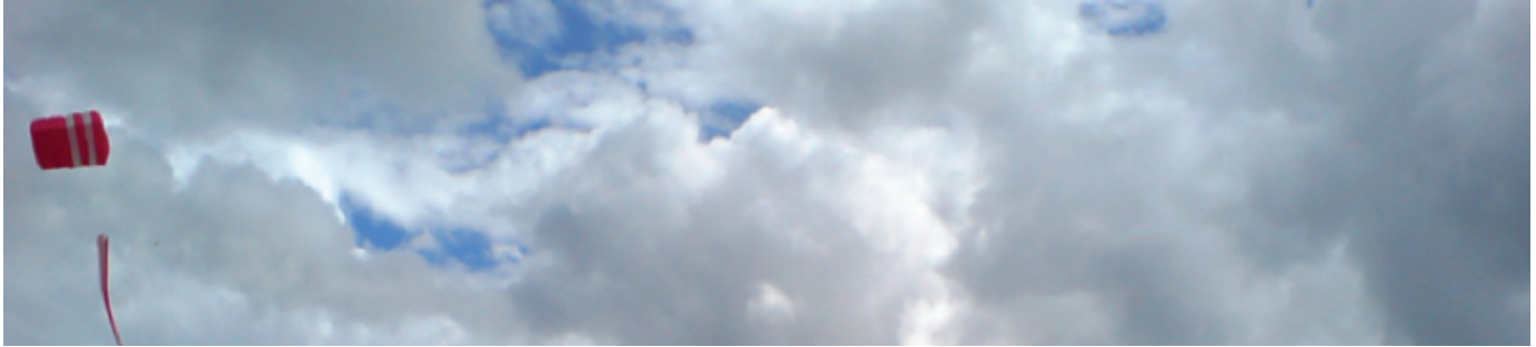
Figure 1: Dream-Walk, Skegness Beach, 2013. (See video one, Skegness Beach).