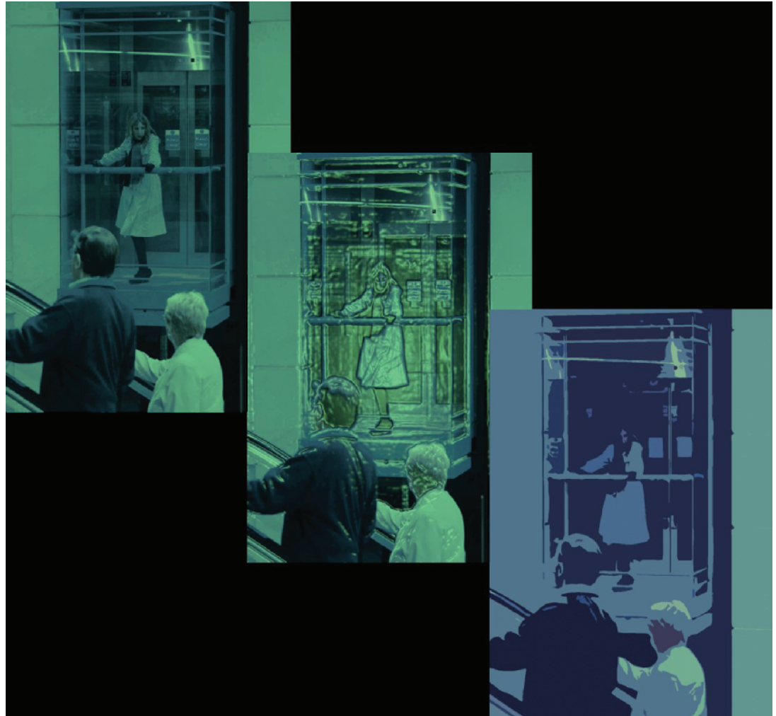
Figure 4: Performer Polly Frame steps aside from the flow of commuters and early morning shoppers in Dream-Work, Nottingham, 2009. (See video five, Nottingham interruptions).