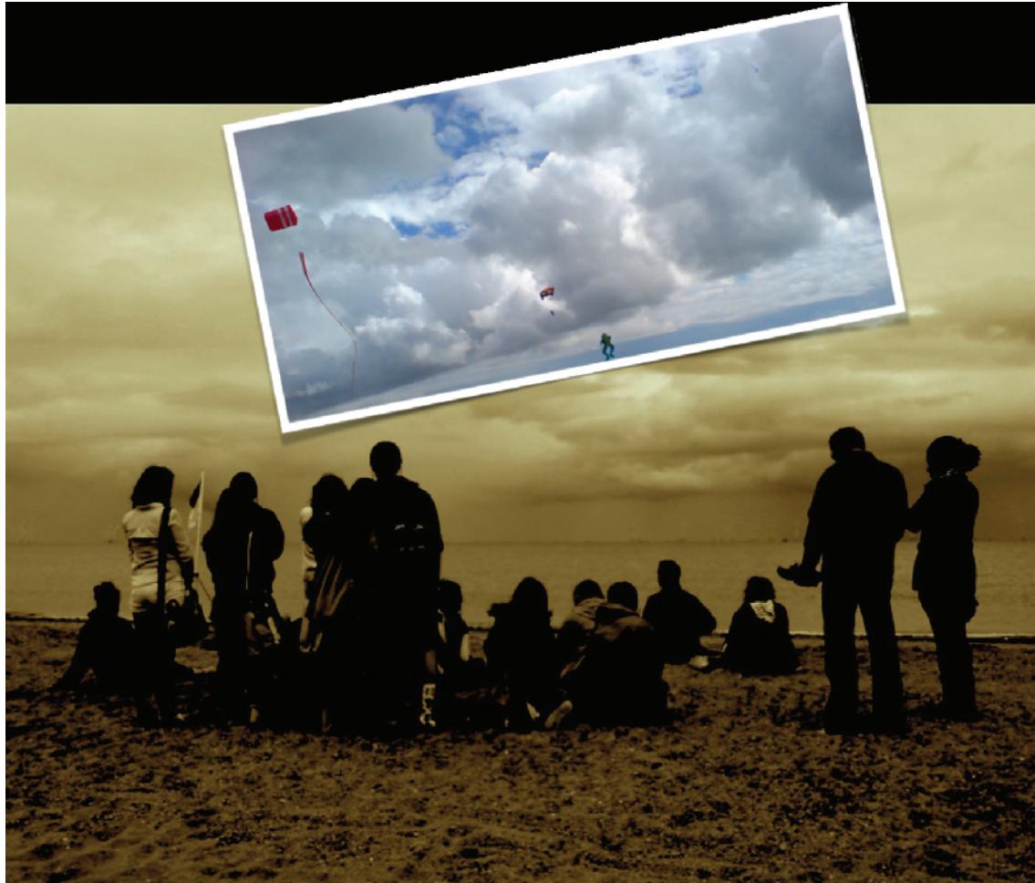
Figure 8: Dream-Walk, Skegness, 2013 . The audience gathered together behind performer Graeme Rose, gazing out to the sea and wind-turbines beyond. (See video fifteen, dwelling in the 'fourfold').