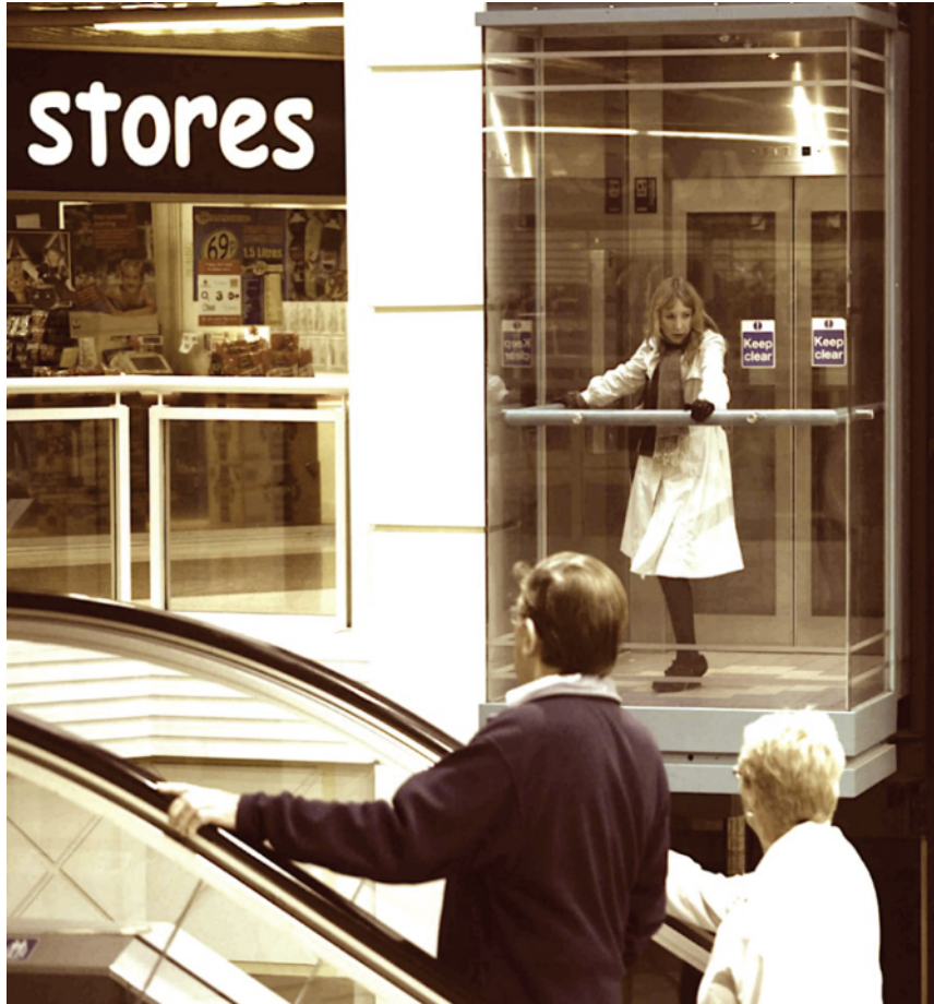
Figure 2: Dream-Work, Nottingham, 2009. (See video three, Nottingham shopping centre).