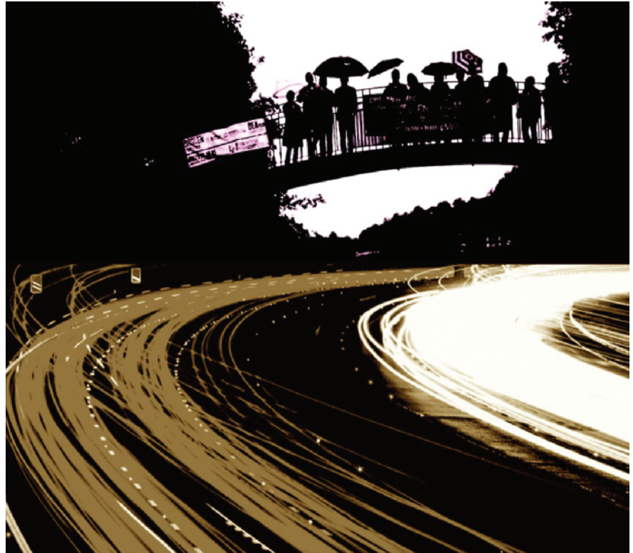
Figure 7: Dream-Walk, Wirsbworth, 2011. Performers and audiences dwelling together on the central bridge overlooking the town's main road. (See video thirteen, Wirsbworth geology).