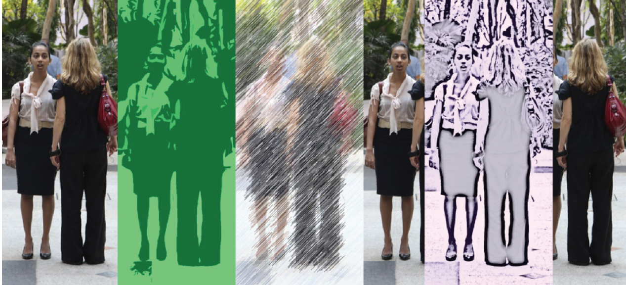
Figure 3: Dream-Work, Singapore, 2009. (See video four, Singapore soundscape).