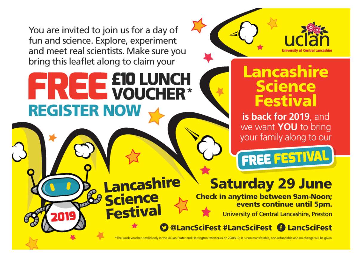
Figure 3: Community Pass 2019

position for the lunch voucher offer. Passes were again individually numbered.