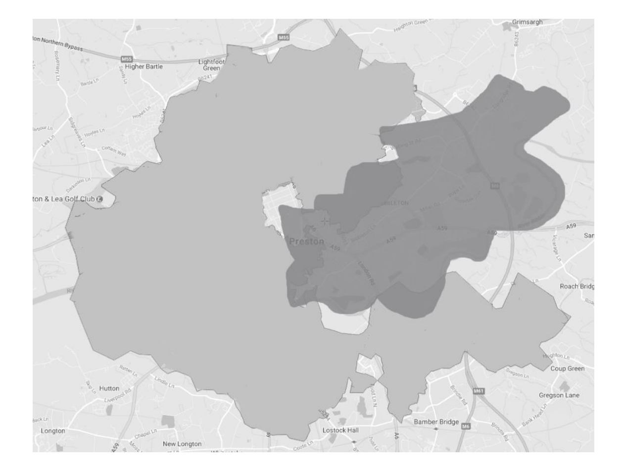
Figure 1: Areas of Preston with higher rates of LSF attendance. Light grey areas are those where more than 1% of families attended LSF in 2017. Darker grey areas are local wards which are in IMD d1 nationally.

Given this, and the demographic attendance data detailed above, organisers determined to initiate a project to attract families from lower-SES areas of the festival's immediate environment to attend in greater numbers. The project ran during the 2018 iteration of the festival and, with some amendments, on through the 2019 edition.