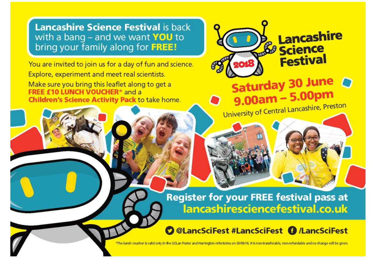
Figure 2: Community Pass 2018

The Community Pass 2018 was designed as in Figure 2. As can be seen, the reference to it entitling the holder to a lunch voucher and science pack was not very prominent. Each pass was individually numbered, allowing researchers to track which method of distributing the passes resulted in the greatest proportion being used.