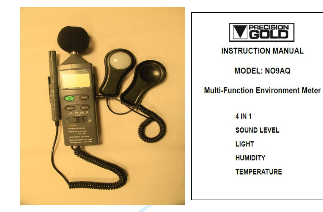
Figure 1: Photograph of Environment Meter