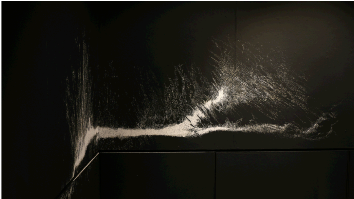
Haecceity – Site Specific wall drawings 2018 Warrington Museum and Art Gallery.

I also created 4 interactive screenprints. The images were printed through silkscreens in a traditional manner, but instead of using normal inks I used conductive ink. This commercially available ink contains fragments of conductive material, which, when dried, allow the conductivity of electricity. The images printed with this ink respond to human touch by conducting the electricity from the hand. When touched, the images triggered sounds recorded while walking on location, transforming the visual into a sonic experience. The recorded sounds were activated through direct contact with the artworks; were necessary in order to gain the experience as captured sounds were played from various points around the gallery – not necessarily from a point closest to the trigger – requiring participation and movement in order to fully engage with the pieces. 7 In this way, the viewer's normal line of vision and behaviour in the gallery was challenged, through a combination of senses, experience and memory.