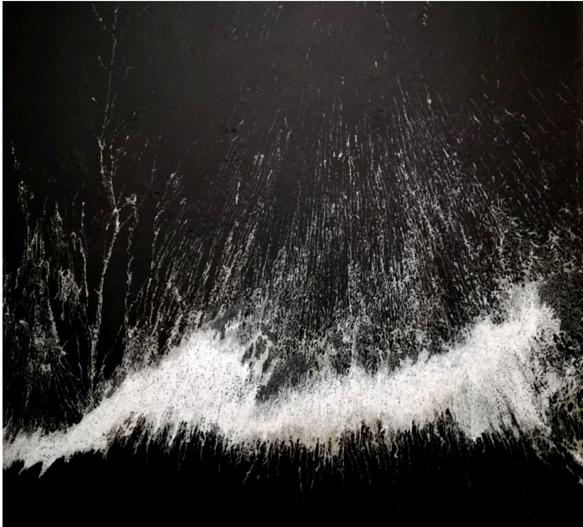
Haecceity – Site Specific wall drawings (detail) - 2018 Warrington Museum and Art Gallery.

interface', 6 the point at which surface and weather combines to immerse us through multiple senses, informing knowledge and instilling memory.