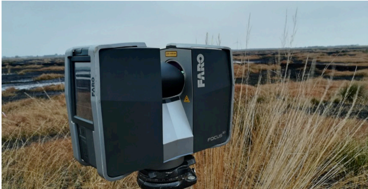
FARO focus scanner on Little Woollen Moss 2018

For me there is an exciting challenge when taking precision equipment and finding alternative uses of its capabilities. Technical collaboration between myself, FARO and science technicians at the University of Central Lancashire has been essential in the development of my projects. Different working methodologies challenged and expanded the possibilities of the equipment and software. Individual skills, curiosity and an enthusiasm to explore new possibilities led to new knowledge. Through this collaborative process came an understanding of how an artist's traditional preoccupation with ethereal qualities and interactions of tonal values could be captured and then translated using digital instruments.