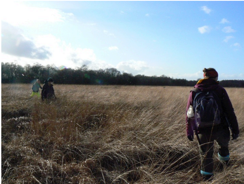
Moss identification survey with Lancashire Wildlife Trust – 2015

Wetland locations are challenging environments in which to make artwork. They require sensitivity to environmental factors as well as an understanding of the physical geography of the land. The identification and selection of locations for my projects are done in close consultation with local trusts and agencies. Four sites were identified for this project, each having played an important role historically in the development of the local community, as well as having being significantly altered over the last sixty years in the name of progress, before finally being recognised as a valuable component linking communities to their cultural history and sense of place.