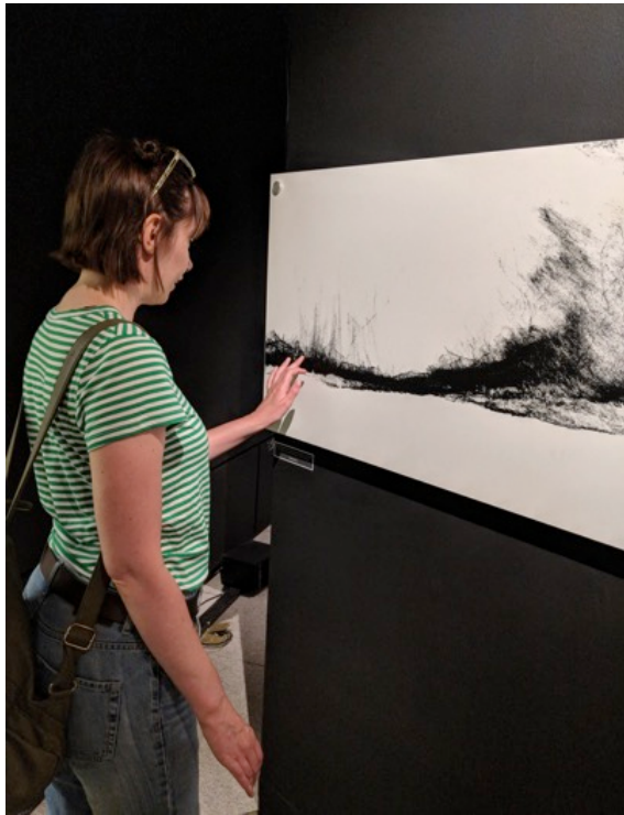
Haecceity – touch responsive screenprints. 2018