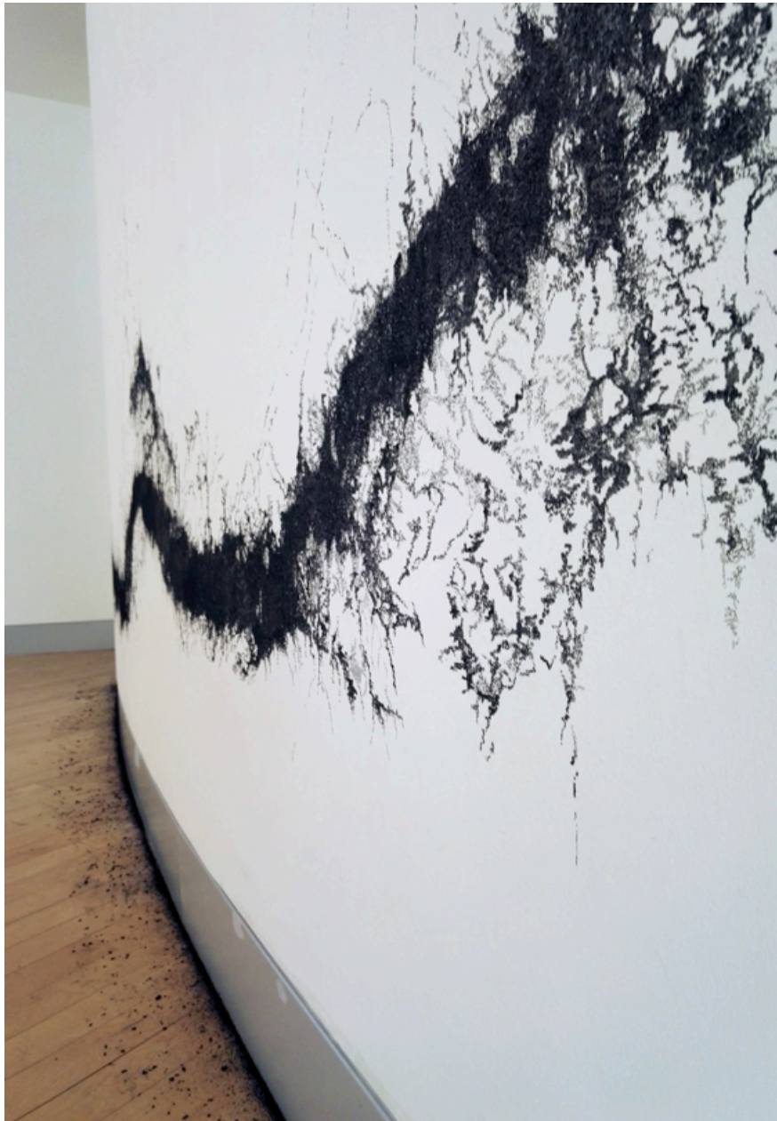
Matrix of Movement – Site specific charcoal wall drawing, The Brindley 2015

Intaglio etching plates are created using acrylic based processes and photopolymer films. These photo-reactive films have been an important development in the printmaking world in the last twenty years. Developed for the circuit board industry, they carry the ability to record and transfer huge amounts of data. For artists the development of these films have enabled the photographic transfer of images onto metal plates without the need for chemical etching, creating surfaces akin to traditional intaglio etchings. The prints are large scale, with single plates often nearly a meter long and extremely labour intensive to print. They are rich in ink and require a constant balancing between depth of saturation of ink on paper with a sense of movement and light.