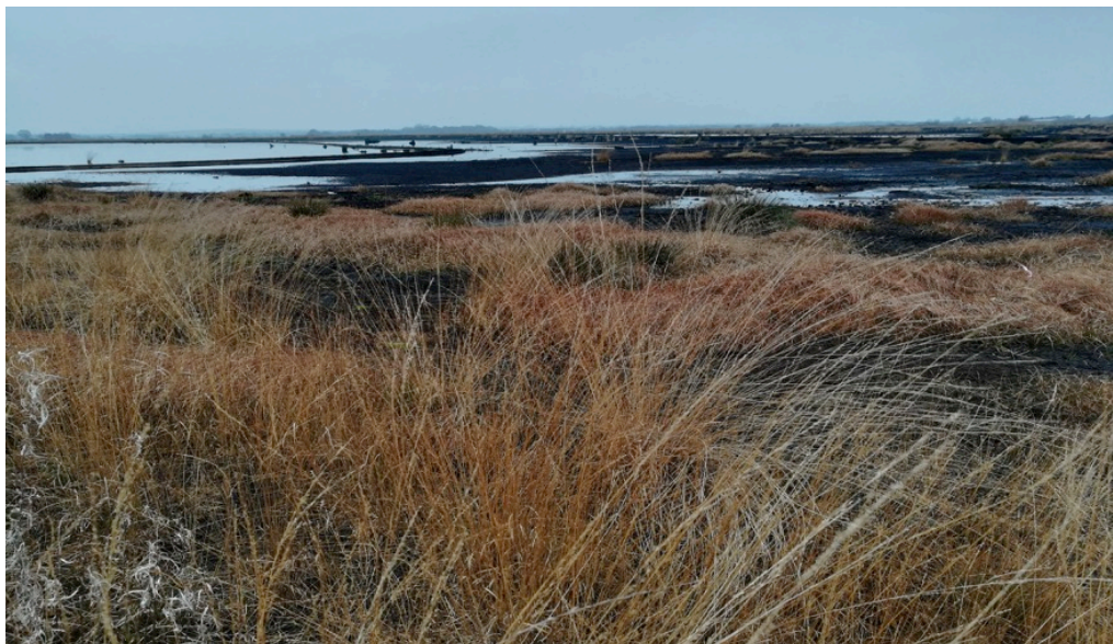
Little Woolden Moss - 2018

My recent projects Matrix of Movement (2016-18) and Haecceity (2018) bring together the worlds of fine art, ecology, environmental science and commercial surveying technology. The artworks emerging from this interdisciplinary amalgam seek to challenge our preconceptions of post-industrial landscapes. Such spaces are complex, precarious, transient and unpredictable, reinventing themselves to accommodate the changing economic and urban world which surrounds them, but never completely surrendering to the desire of human occupation. Sadly, it is my perception that these wetland spaces are seen by many as worthless, left vulnerable to industrial and military exploitation and branded as exclusion zones, reinforcing perceptions of them as empty wasteland or terra nullius – land belonging to no one. Thus, commercial interests are free to take profit from what they advocate as the necessary and progressive reclamation of land, and in doing so cause destruction and the subsequent extinction of these living landscapes.