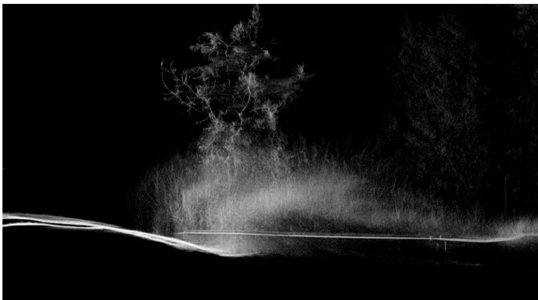
Standing Ash - Intaglio-type Etching 2017

The process of taking the scan data out of the computer and recreating an etching or drawing is key to the works. Captured digital data combines with traditional printing and drawing, resulting in a re-imagined vision linking digital and aesthetic. More widely, I am considering whether we should unconditionally accept and trust digital information presented to us. My images begin as data files, moments in time collected from real locations, the resulting artworks however, are my memory of sensory experiences and personal knowledge as experienced during walking. They are a form of waymarker and not designed to map locations or guide audiences to specific destinations; instead, the viewer is required to bring their own memories to enable a personal journey and complete the story. Matrix of