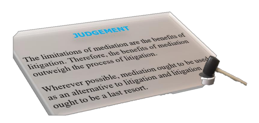
Figure 4 - Judgment

The above model and presentations illustrate that both the landowner or his or her estate, and the claimant can be winners in a claim of proprietary estoppel. Thus, these recommendations provide realistic solutions that are practical and feasible, to help overcome the challenges and controversies in the practical application and operation of the factual components integral to a successful claim founded on proprietary estoppel.