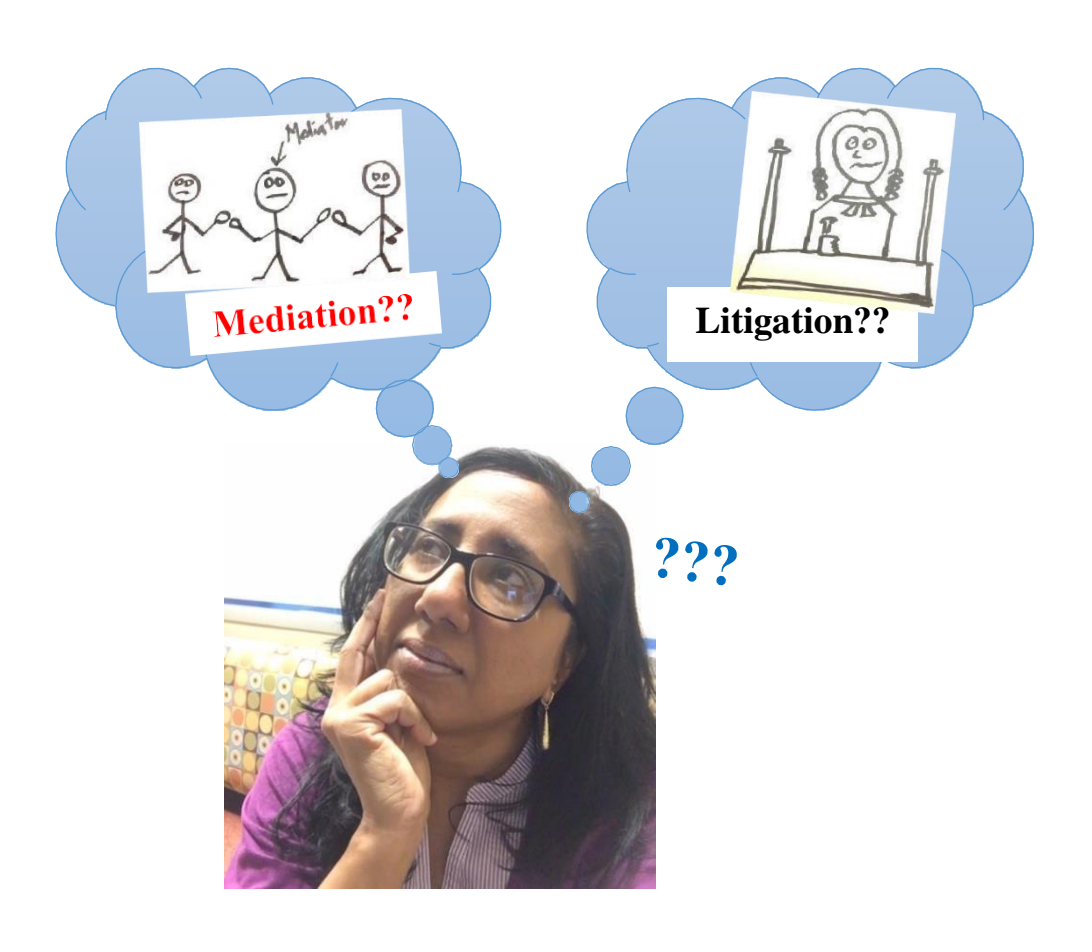
Figure 2 - Mediation v Litigation for Proprietary Estoppel

Mediation is proposed as the most suitable process to resolve claims in proprietary estoppel as the following presentation illustrates: