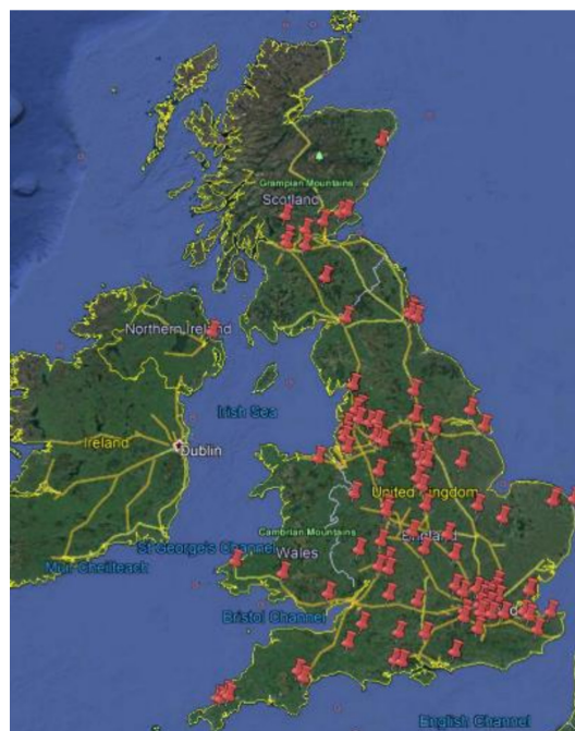
Figure 1 Geographical location of survey respondents (n=154). Each pin represents a single postcode (first three or four digits).

One hundred and fifty-six people completed the two mandatory questions (confirming that they were an occupational or physiotherapist and that they were currently clinically working with stroke survivors at any stage of their recovery in the UK). Two respondents'