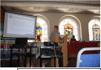
Dame Vera Baird presenting at our conference

Equally pertinent is that a legal prerequisite for employers to support victims to remain in work whilst experiencing abuse would support the Government's plan as part of the legislation to 'make illegal' economic abuse of the victim by the perpetrator (Casciani, 2019; Moore, 2019).