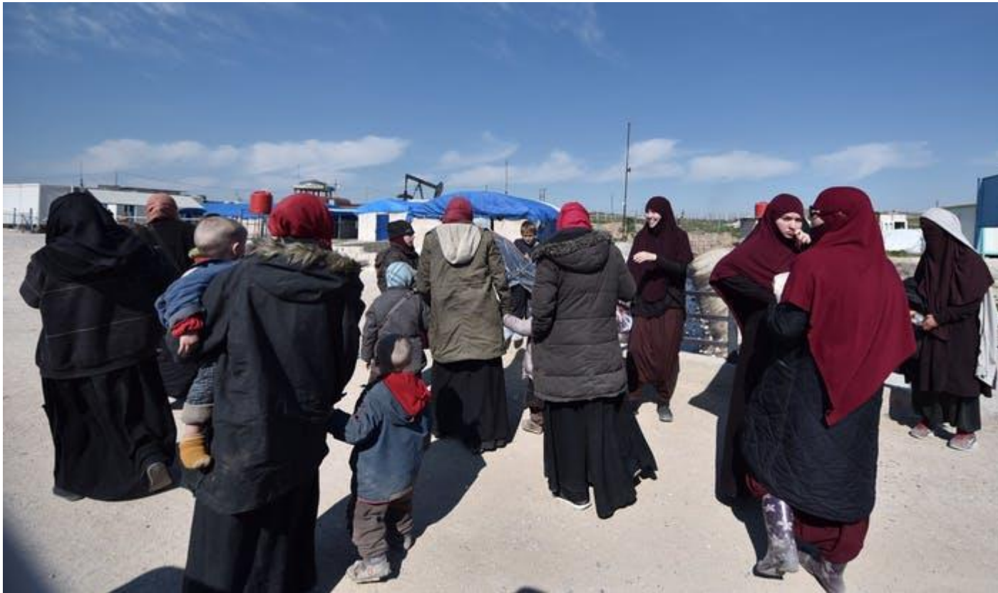
Roj camp in north east Syria has housed wives of IS fighters and their families.

even those people who have serious concerns about the actions of their government may not publicly protest, offer support, or challenge the decision, perhaps believing others will , or fearing repercussions if they do so.