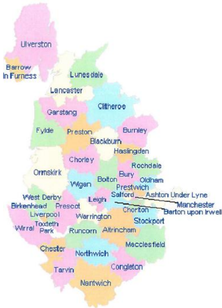
Figure 1: Poor Law Unions in North West England