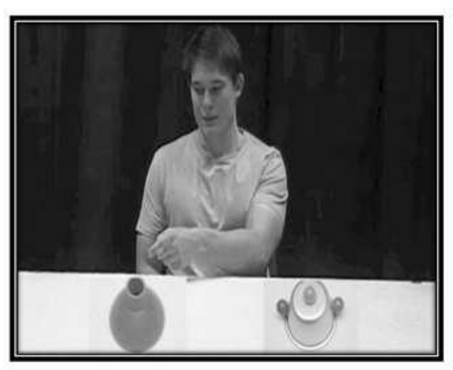
Figure 1: Example image of an eye gaze + pointing trial