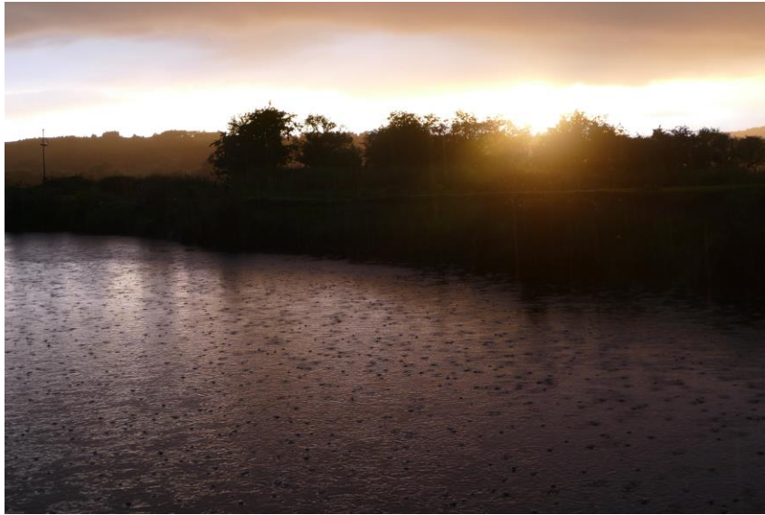
Figure 8. Black water

Writing this posed a number of questions for me. I had to ask myself, for example, whether, as someone who is much affected by seasonal low light, I was over-influenced by the gloomy room, transposing my mood onto the aesthetic of the matrix; whether or not I was discomforted as an outsider to this group; whether I was too inclined to bring a therapeutic frame to bear on the group's reaction to J's apparent depression.