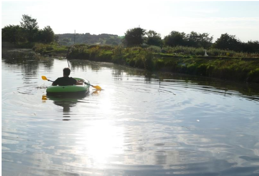
Figure 3. "Closer to water"

This other world suggested a lost world of the textile industry and its passing, family members who had worked in the mills, the industrial heritage of Lancashire, and the singularity and beauty of its landscapes.