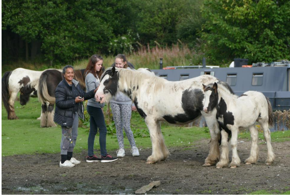
Figure 5. "Horses had babies there"

...the horses had babies there and we understood a little bit more about their way of life and how you know they ... and one day we came a baby was born. And the foal was on the ground so all of them [mares] crowded around that little foal. Wildlife that needs protection It was really a pleasure to be able to see something from such close quarters. Well, I've never seen anything like that before. I've seen horses on the TV and as a child in Pakistan, but not babies fresh and newborn and protected.