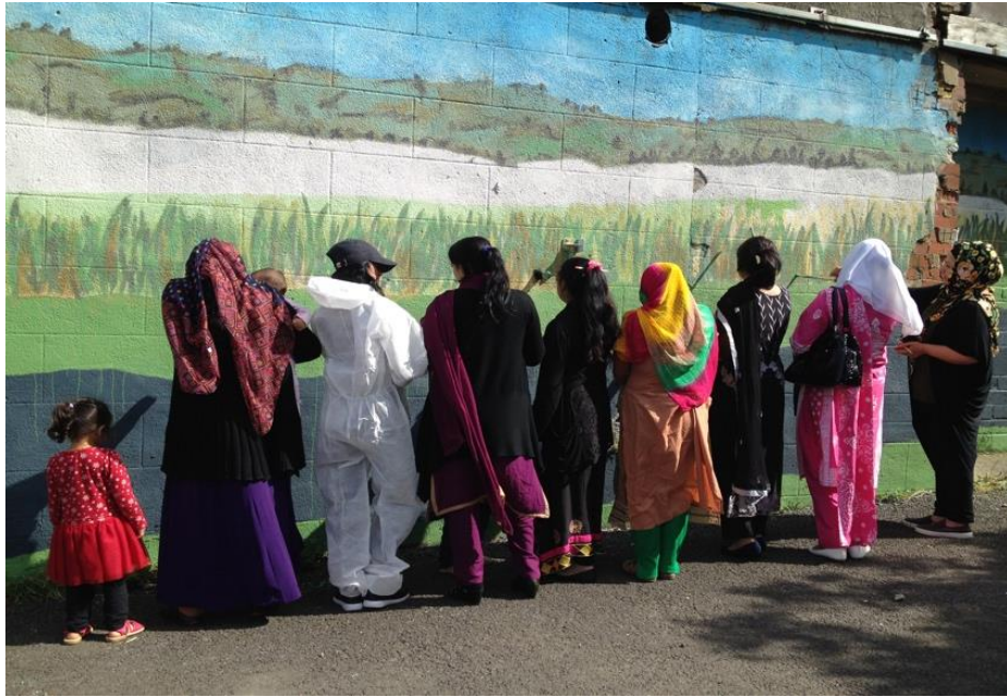
Figure 6. “Something there that’s still alive “