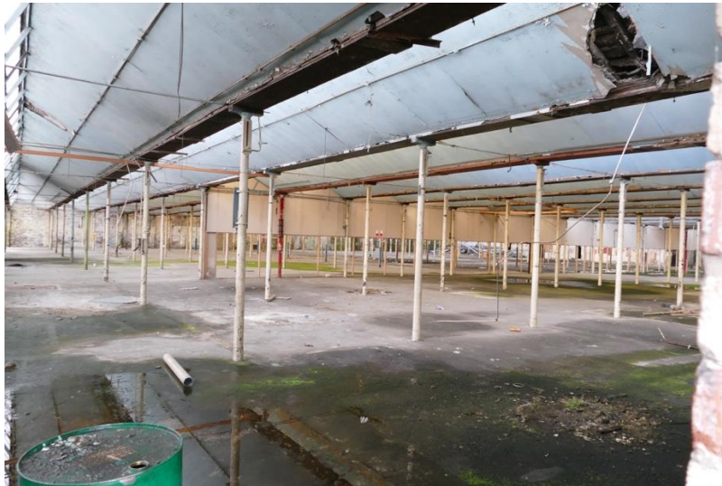
Figure 4. "There's an emptiness there"

I think the emptiness is something. I think it struck me as being an empty place now and I think something like you said... there's an emptiness there for you now, which is quite, you know, it's quite sad.