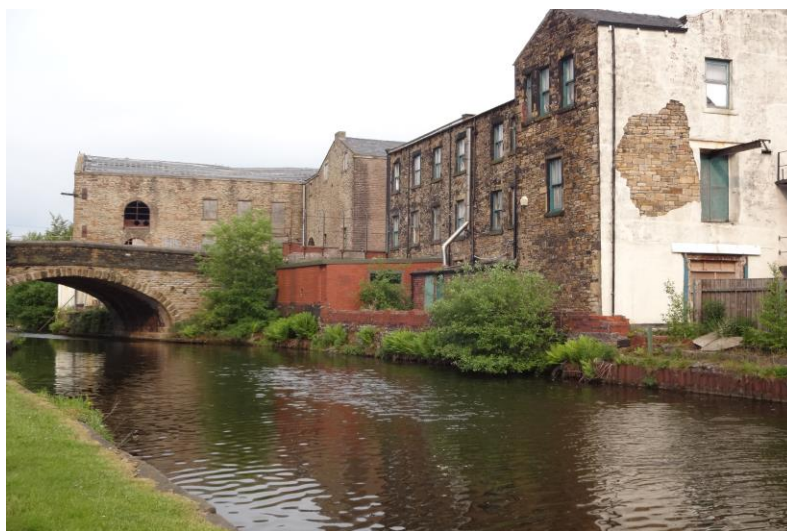
Figure 2. Post-Industrial Heritage on the Leeds and Liverpool Canal

'Idle women on the water' was an art project that took place over several months in 2016 on a stretch of the Lancashire and Liverpool canal in Northern England 6 . It created a floating art centre in a butty pulled by a narrow boat which hosted a series of residencies by women artists and writers and a programme of participatory activities. The project was run in partnership with Humraaz, a South Asian Women's refuge and a local women's centre and residents from a nearby housing estate. They created a temporary community which came together to eat, talk and make art over the summer months. The canal surroundings offer an uncultivated environment of animals and plant life but are dominated by a semi-derelict architecture of disused textile mills. Some of the women had found this combination of Nature and post-industrial heritage strange, and at first threatening, but came to appreciate it as a repository of local history and regional identity as time went on.