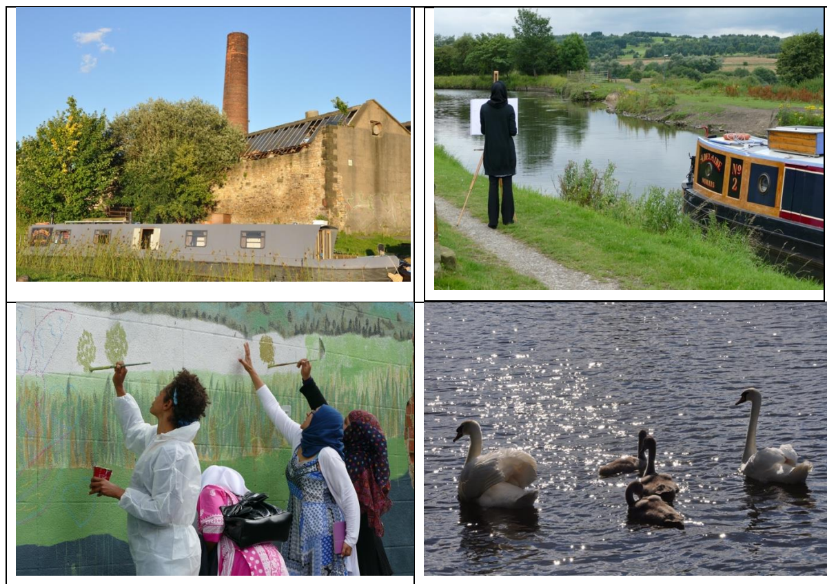
Figure 2. Selection of stimulus images

I assured the group that after viewing the slides in silence they would be free to contribute or not, according to inclination and without turn-taking. As is usual in a visual matrix I asked them to present what images and associated ideas came to mind as and when the moment seemed right. They were informed that the process would run for 45 minutes and that there would then be a short break before we discussed what had emerged, after which there would be an opportunity for comments or further questions. I asked who wanted to present the first image, and during the matrix intervened only twice – each time to offer an image when the group appeared to be drifting into a dialogue between two of its most talkative members. Even then I took care not to present new material, staying close to the imagery that participants had already been developing.