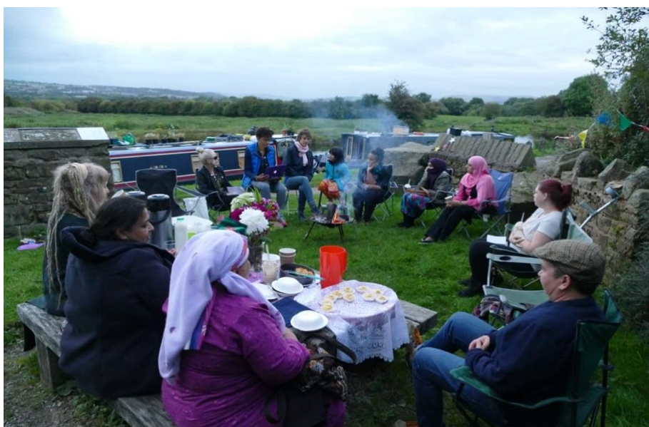
Figure 5. "Meeting people from all over"

....where anybody would come - a very easy going person to a very highly intellectual person could go. And we had a luxury of meeting people from all over - some people came from London.