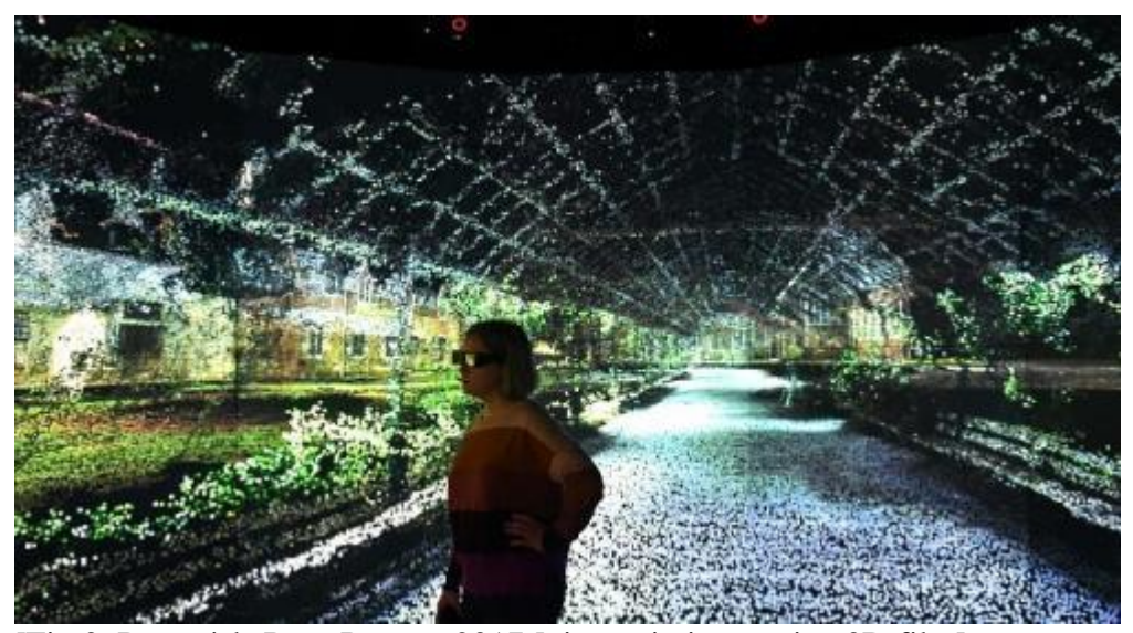
[Fig 3. Parragirls Past, Present 2017 [viewer in immersive 3D film]

The film voiceover, created and spoken by the women, emerged through initial experiments in which they roamed the site in pairs, recording their conversations, and comparing memories and perceptions. Thus, the voiceover is less a narration for an imagined audience, than an emergent discussion. As with Awkward Conversations , the aesthetic technique was intended to promote a process of elaboration within a holding space—with the distinction that in this case, the facilitating environment had to be engendered within the walls of the Parramatta site. It is in this very profound sense, that Parragirls Past, Present differs from objective (or sensationalising) reports of the site's notorious past. The aim—and unique capacity—of the immersive film as an arts-based psychosocial inquiry was to locate the continuing effects of trauma in present day interactions. It is in this way that we come to understand the force of institutionalised discourse.