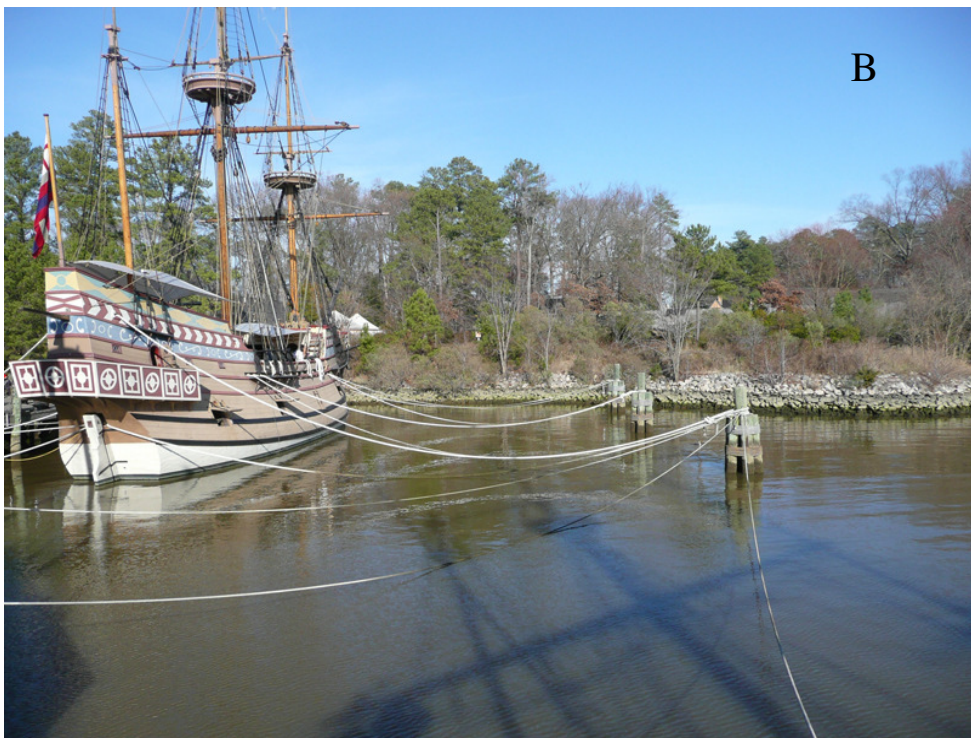
Figure 1. Two representative sample scenes. In Panel A, the target was the bench. In Panel B, the target was the flag. Search was easier in the scene in Panel A than the scene in Panel B.