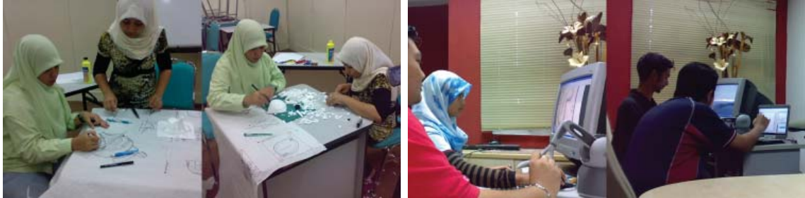
Figure 2: Prepared traditional (left) and 3D sketching (right) design settings.

data collection was the Studio Master of the course. The conducted case study identified the characteristics of current design media and collaborative design culture of conceptual architectural design process. Consequently, the recommendations of the case study research helped us to develop theoretical foundations of the study.