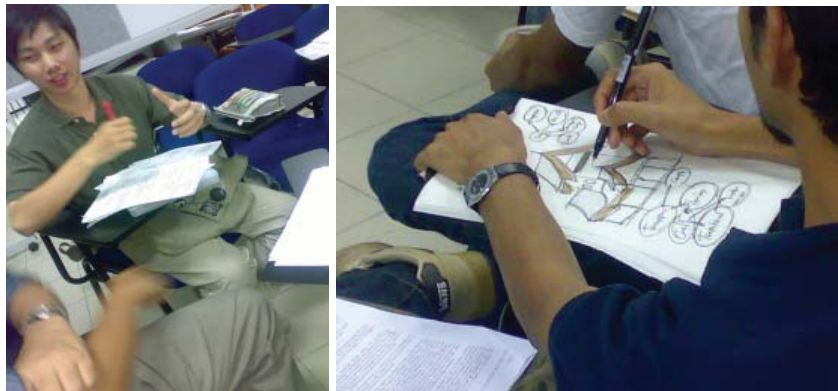
Figure 1: Individual and group activities of students (Source: Pour Rahimian and Ibrahim, 2008).

Our early qualitative case study research (Ibrahim and PourRahimian, 2010) employed ethnography for data collection and artefact analysis for data analysis. Units of analyses for this part of study were design artefacts of a 2nd year architectural design studio at a local university comprising of 37 students and four studio mentors (Figure 1). Taking into account the nature of the building project that they examined, the study adopted the judgment sampling method (Kumar, 2005) to choose the sample population among available different studios. The gatekeeper during the