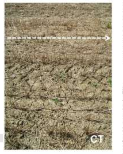
Figure 1. Study plots with low (mouldboard plowing (CT), left) and high (reduced tillage (RT), right) dew worm density. The photos were taken from the edge towards the plot center (dotted line) with the residue bed left by the combined harvester. The arrow indicates the direction of harvest. In the CT plot, the margin area has little residue, in the RT plot, residue is more evenly distributed across the plot. The bar charts show the mean density of dew worm middens (+s.d.; above) and mean proportion of straw at margin (+s.d.; below).