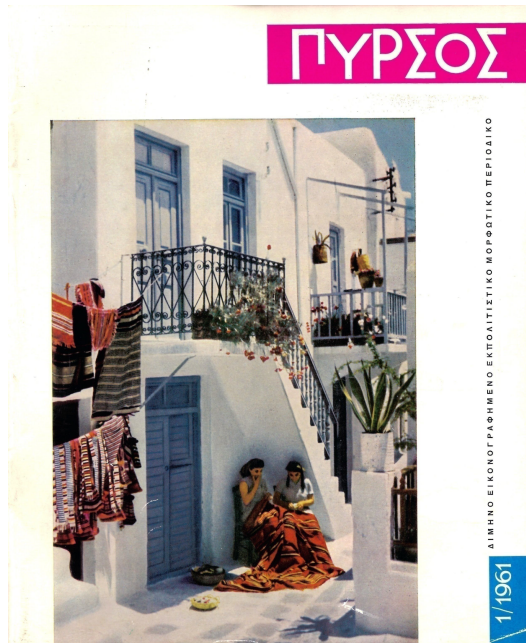
Figure 2. Front cover of Pirsos , Issue 1, 1961.

Pirsos ' radical patriotic rhetoric, as exemplified in its representations of the Aegean, is further elaborated in the magazine's portrayal of its 'people'. Here, the Aegean is no longer a symbol of eternal beauty. Instead, it becomes the backdrop to the lives of poor, but hard-working, inhabitants who are frequently presented as 'abandoned by the state', or 'left behind by the effects of economic migration'. The Aegean 'people' featured in Pirsos since its very first issue (Figure 1). On the photograph of its first cover, Pirsos depicts two young women protecting themselves from bright sunlight under the shadow of a quintessential Aegean balcony. The young women are working on traditional rugs ( koureloudes ) and, as other Penelopes, they seem to be stood still in time, waiting for their destiny to play out. Unlike Penelope, however, their workload is not merely an excuse for passing the time, but hangs heavy on a clothesline next to them.