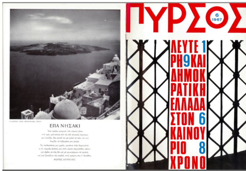
Figure 4. Front and back covers of Pirsos , Issue 6, 1967. Photograph of the Aegean island (left) by Erich and Katja Arendt, reproduced by permission of Rimbaud Verlag. Poem by Fotis Aggoules, reproduced by permission of Triantafyllos Mylonas.

Pirsos does not shy away from depicting the other Aegean; that is, a site of exile islands and political prisoners. From its launch until the end of its circulation in 1968, the magazine fiercely accused the Greek state of injustices inflicted upon those that fought for the 'country's independence', during the 'National Resistance'. Pirsos published reports from the exile islands as well as prisoners' memoirs, poetry and artworks. It called for amnesty, launched petitions addressing the Greek diaspora within and outside the socialist states and urged the international community to support its demands, especially following the establishment of the Colonels' dictatorship in 1967. As Voglis writes, 'Since the second half of the 1940s, the Greek state had subscribed to the theory "of the permanent civil war" in which the country had become 'an archipelago of punishment', with only a short 'liberal intermission' between 1964 and 1965, before returning to a 'new campaign of terror, arrests, prosecution, torture and imprisonment of its leftist political opponents' (2002: 224). During these years, hundreds of thousands of 'political subjects' 'were deported and tortured' on exile islands in the Aegean before either signing a loyalty certificate 'or dying'