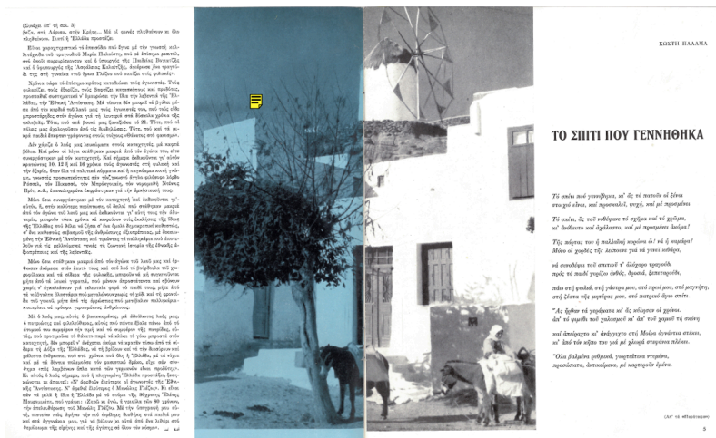
Figure 3. Pages 4-5 in Pyrros , Issue 1, 1961. Poem by Kostis Palamas, reproduced by permission of the Secretariat of Kostis Palamas Foundation.

The representations of the Aegean landscape published in Pyrros were also reflective of nostalgia, a sentiment that was as much constructed by the magazine as desired by its readers. Beyond their serenity and their 'particularly' Greek nature (warmth and sunlight), their culture (architecture) and their traditional (albeit underdeveloped) representations, these images brought to mind Greece's past, reflected its contemporaneous present, and imagined its future. The women who worked on their embroidery, protected from the sun under the balcony, in the previous analysis, and the old woman who loads a sack onto the back of a donkey against a typically Aegean landscape in Figure 2 are affirmations of such concurrent temporalities. It can be argued that these ambiguous representations invited contemplation and excited the imagination of Pyrros ' readers as well as constructed their desire to be transported there, to take their place in the landscape. In one such example, the caption underneath a photograph of two older women washing a pile of rugs in the sea, shifts the attention from the depiction of backwardness and fixes the meaning of the image to that of nostalgia, for the future. It asks, 'Is this our mother washing the rugs while