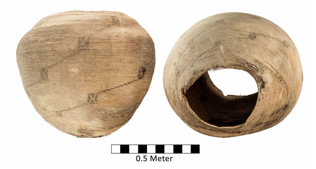
Figure 2. Storage Basket (x?im) (B1), sideview (left), looking through former base (right).