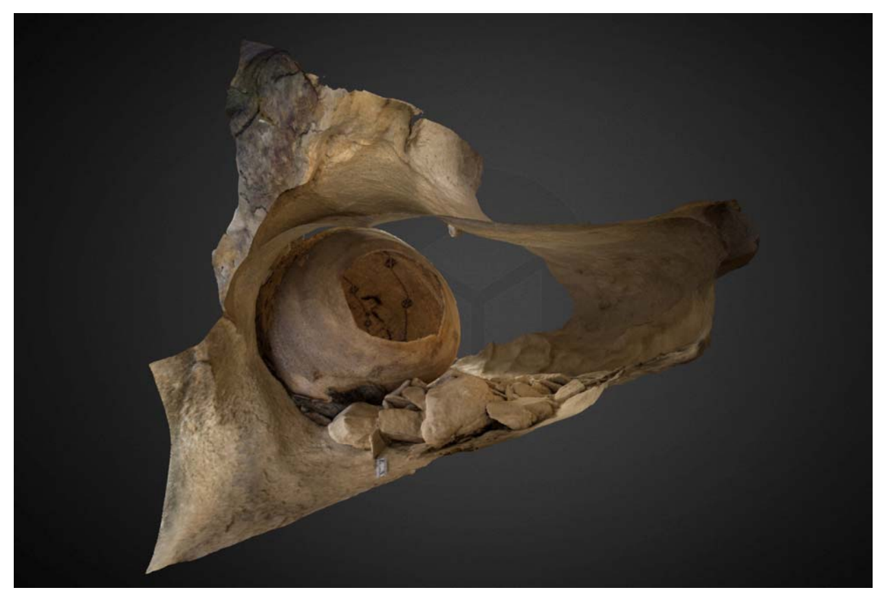
Figure 6. Cross-section of photogrammetry model.

groups such as the Chumash and the caves of the Santa Barbara backcountry may have provided a valuable storage facility.