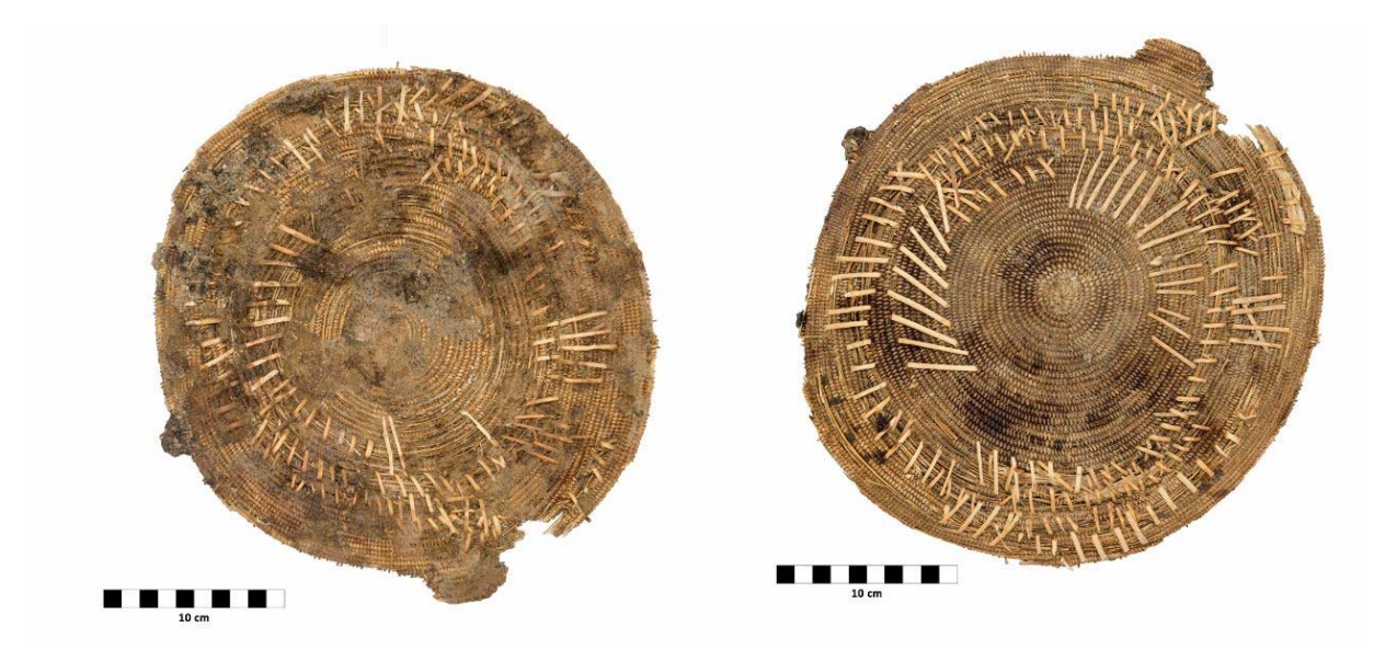
Figure 4. Heavily mended basket (B3), potential base of storage basket.

The parching tray (B2) measures 47 cm across and is more closely coiled (at 5-6 stiches per centimeter) than the storage basket. The surface appears to have been treated with asphaltum, which has left a thick, dark patina (Figure 3). The sewing material is difficult to identify due to heavy carbonization and good residue. It appears to potentially be sumac ( Rhus aromatica ), rather than Juncus textilis , but the identification is speculative. Likewise, the foundation is obscured heavily by use and patination, but appears to be a deer grass ( Muhlenbergia rigens ) foundation. The convex surface utilized intentional split stitches, while the base, and repairs to the base, utilized non-interlocking stitching at 3.5 coils per centimeter. Approximately 35 percent of the parching surface is missing, with gnaw marks from rodents evident. The original rim coil of the parching tray was also absent, but the outermost remaining coil shows polish that suggests it served as the rim for some time after the original rim coil was lost, prior to caching.