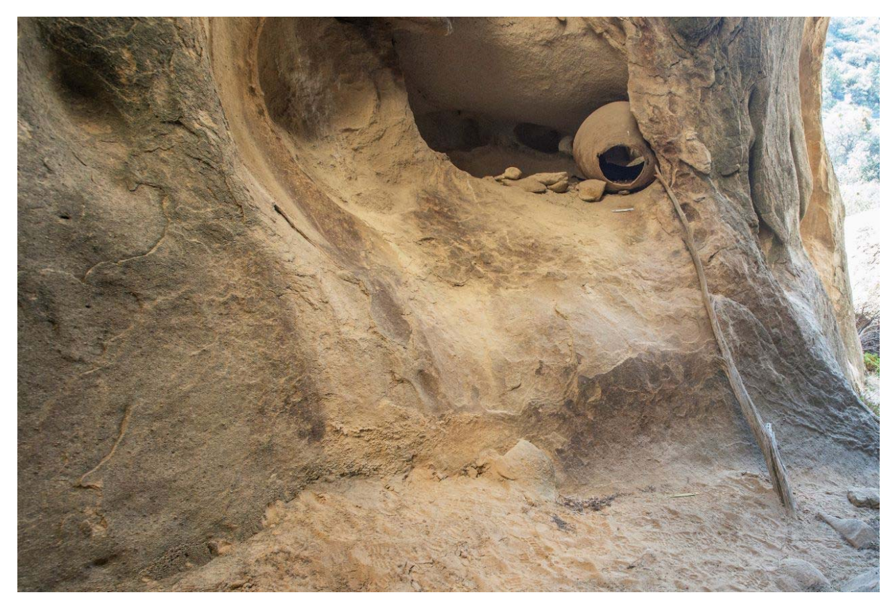
Figure 5. Bryne Cache in situ with cave stick.

and location within the storage basket suggests it likely served as the storage basket base, a repair after the initial base was lost. It is not evident whether the basket was intentionally made to serve as a base for the storage basket (B1), or, whether the basket was repurposed as the base after being damaged.