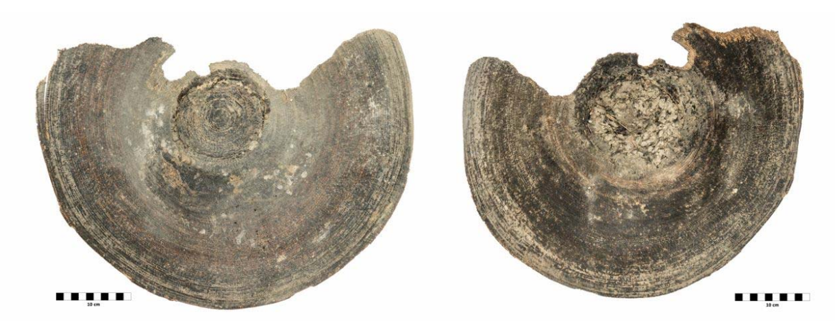
Figure 3. Parching Tray (B2), working surface on left.