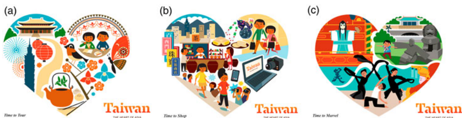
Figure 2. Logos for the 'Taiwan – The Heart of Asia' campaign. Provided by the Tourism Bureau, Ministry of Transportation and Communications, ROC. © 2016 Tourism Bureau, MOTC, Republic of China.

combination legitimised by a long tradition of landscape painting. A similar role was played by shows of aboriginal cultures, or sites commemorating figures and events significant both for PRC and Taiwan's history. By contrast, local people confronted with the presence of large PRC tour groups felt alienated from the above-mentioned areas and de-territorialised them as Taiwanese by deliberately avoiding them.