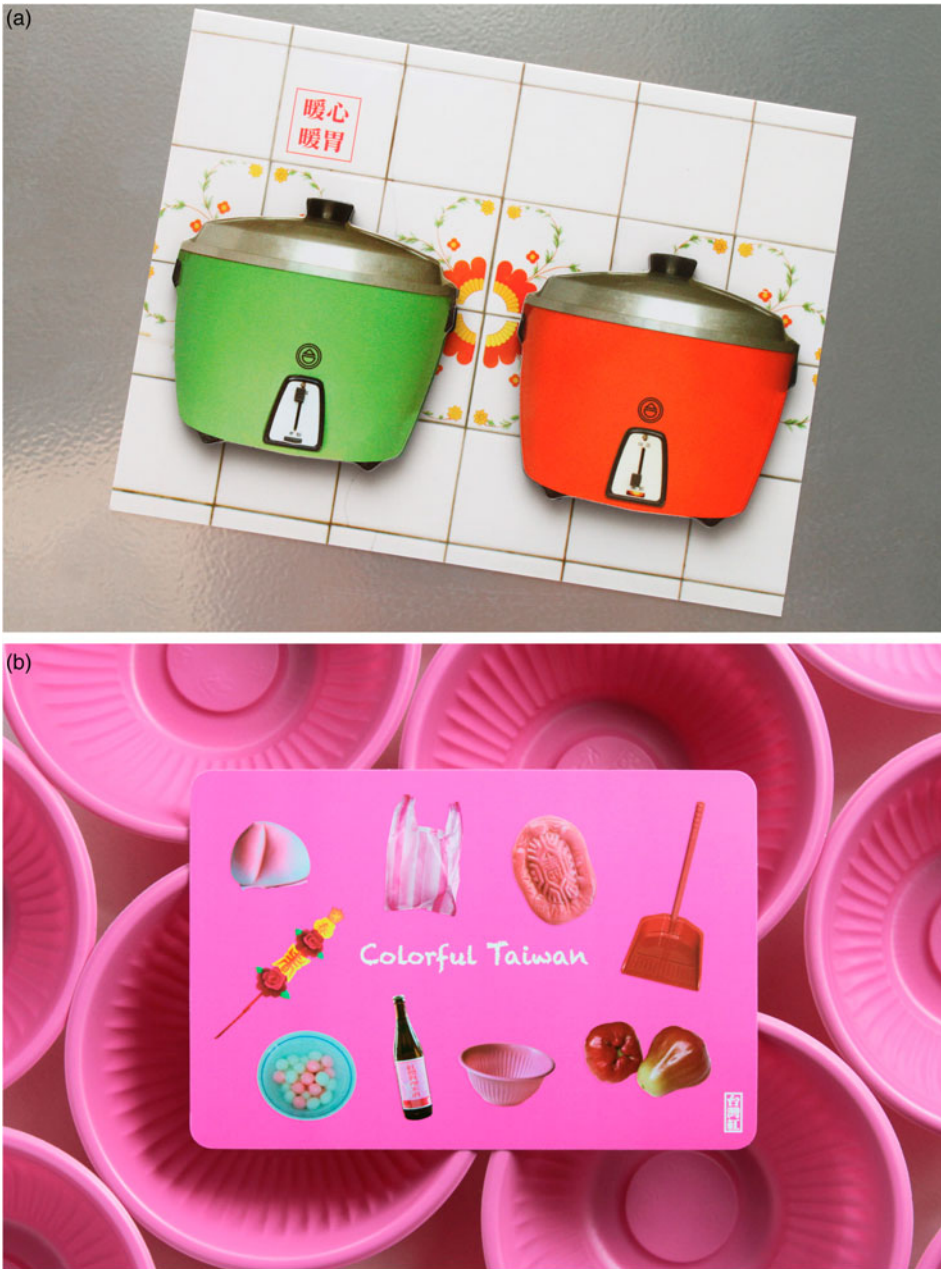
Figure 3. De-naturalising everyday objects and sights: Ben's 'Taiwan Goodies Magnet – Rice Cooker' and 'Colorful Taiwan – Taiwan Red' postcard. © 2017 Miin Design Co. Ltd.

Ariel focuses on urban sights from Taipei. His souvenir series features living quarters seen from above as they have developed over the years, with roofs crowded into each other, of various sizes due to added illegal extensions covered with iron sheets, pigeon cages, small temples or gardens. The realistic drawings emphasise the haphazard character of such areas through minute details of laundry hung out to dry, odd objects stored on