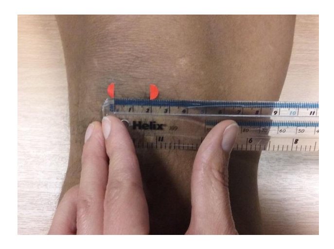
Figure 1: the total medial-lateral patellar glide test with markings on the skin