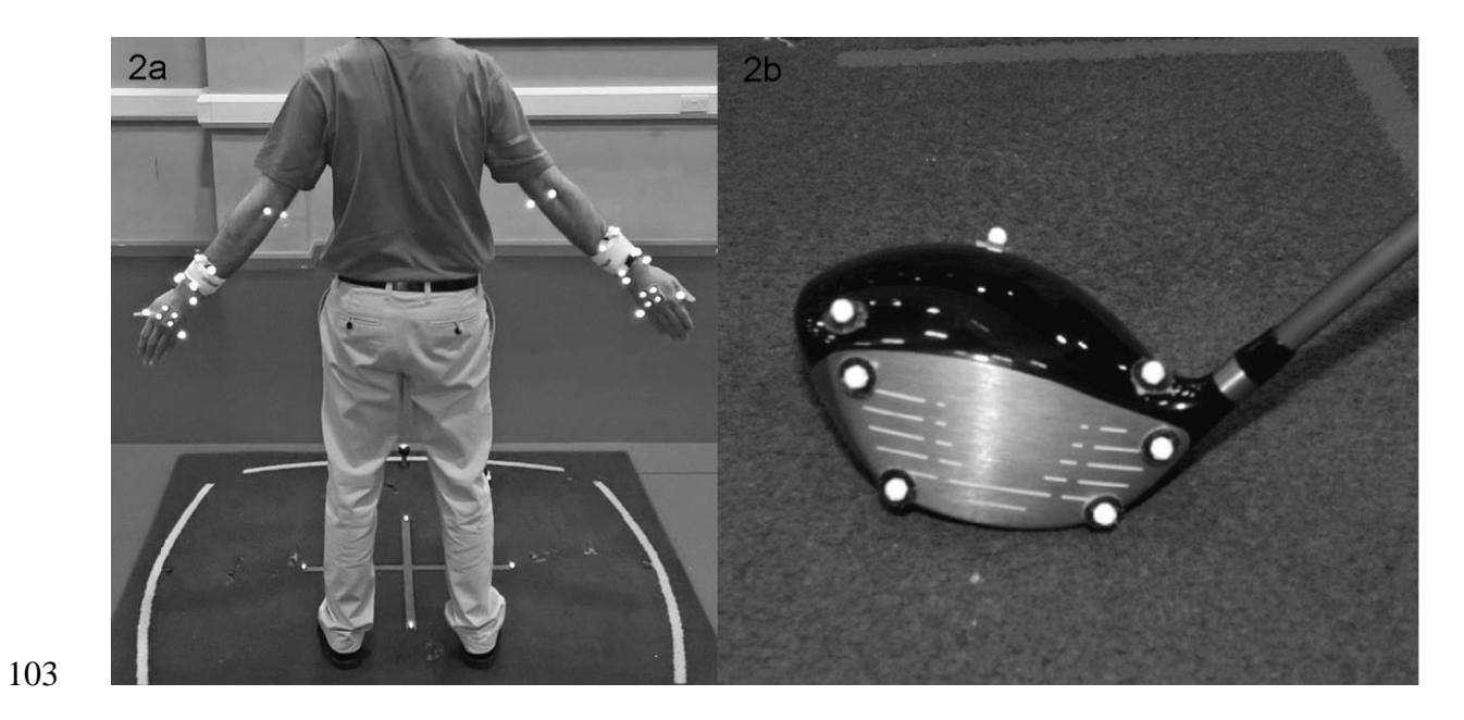
Figure 2. Anatomical and cluster marker placements on the forearm and hand segments, ball marker and floor markers (2a). Club head and clubface marker placements (2b).