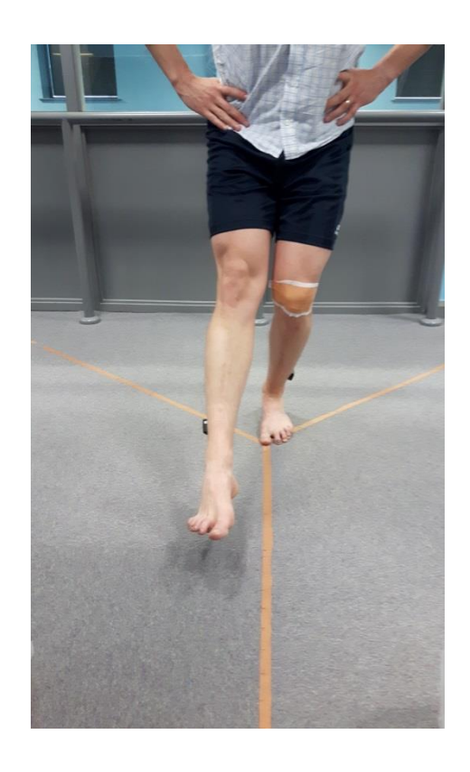
Figure 1. Participant performing the anterior reach of Star Excursion Balance Test (SEBT) under the McConnell tape condition (left leg standing).