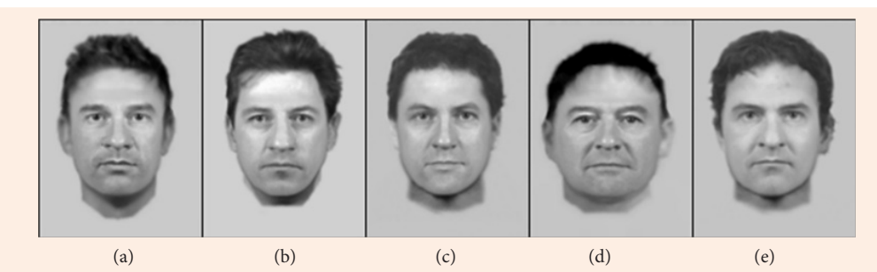
Figure 2: Example composites of actor Karl Munro constructed by condition:

Design: Composite likeness ratings was a within-subjects' design, with further participants rating both upper and lower halves of composites constructed from all five conditions.