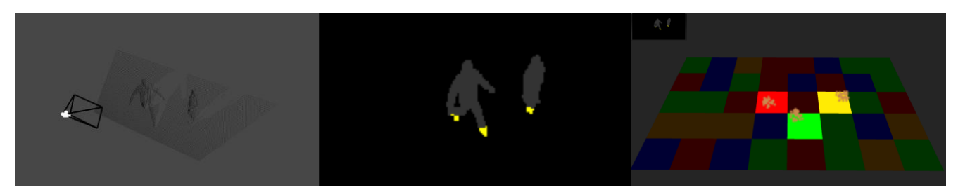
Figure 3: Left: Depth map rendered. Center: Feedback detection with grouping points of interest near the floor surface. Right: Player feet positions projected onto interactive surface.

The system is based on the Google Tango³ device which is used for tracking player movements as well as rendering the game graphics. Presently the system is limited to projections on horizontal planar surfaces where the system currently only tracks players' feet (see Figure 3). While the Tango point cloud detection is limited on average to 10 FPS, more responsive detection is done by tracking feedback zones inside the captured image using Tango's rgb camera. The system distinguishes between players through colour tracking, hence in the current version unique footwear colour is required in order to play a multiplayer game. The tracking system utilizes depth camera and colour based tracking techniques. In order to enable easy integration with new and existing games, a decision was made to make our system compatible with Unity game engine and offer our player tracking and game projection solution as a Unity template better know as Unity prefab⁴. We decided on this in order to enable easy integration when modifying existing or creating new games that are compatible with our platform.