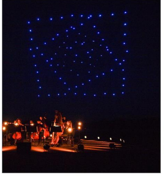
Figure 1 Caption