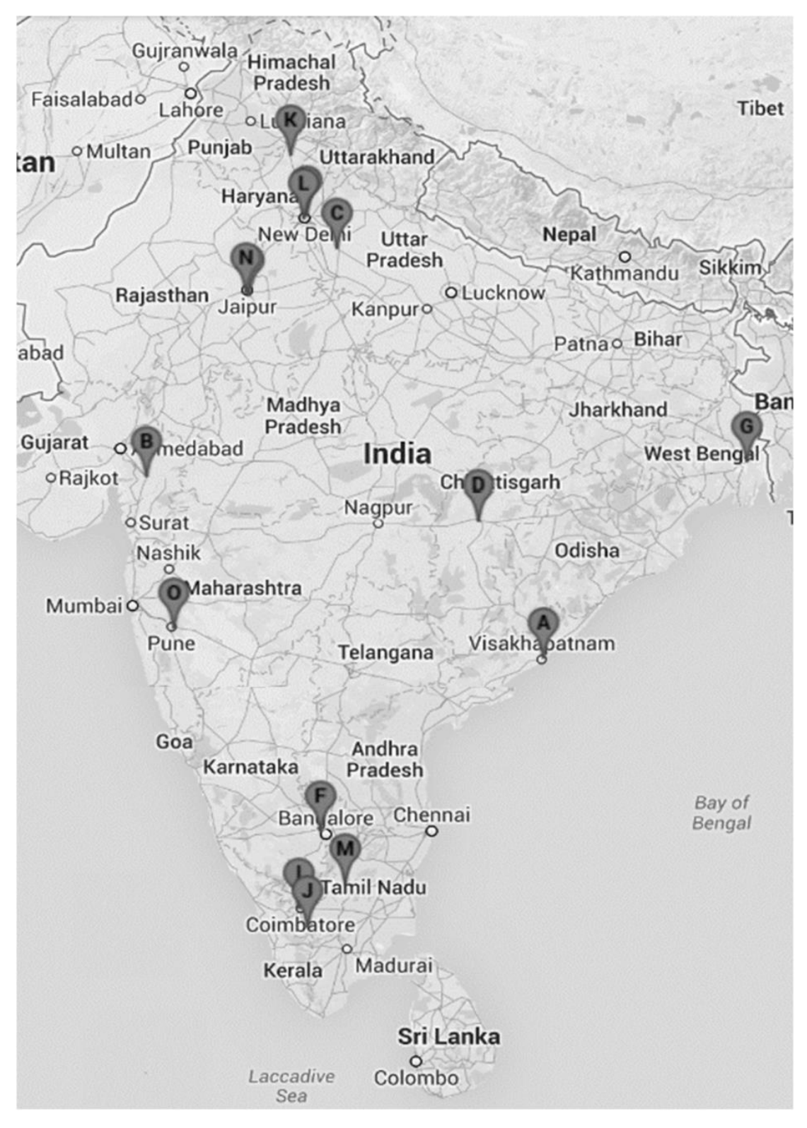
Fig. 1 Map of India indicating the location of earthworm suppliers included in Table 3 (Source: Google Maps).

In South Africa, two companies that did not farm worms, identified two additional vermiculture businesses in their area, which were then included in the analysis. Of the total non-respondents, two companies had gone out of business and five confirmed that worm farming was their main business,