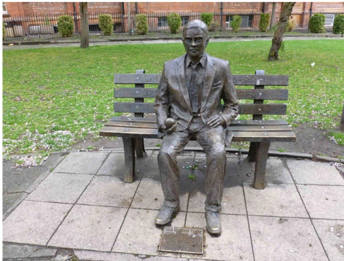
Figure 1. Alan Turing statue, Sackville Gardens.

the ways “you’re told to see certain things” and how he’s got his “own eyes”. His descriptions focus on notions of visibility and invisibility, what is seen and unseen by different people. The word “twisted” is both expressive and ambivalent in the above quote. He describes a certain self-respect which he takes from taking his own twisted view of society, and also describes how by developing his own personal day-to-day practice of looking, listening, attending and acting he has been able to find a way through, to manage the city’s most urgent risks and to gain a certain kudos from his peers by doing so.