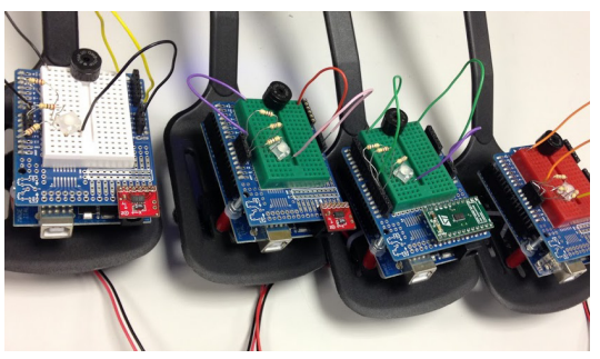
Figure 2. Completed 'Digital Egg and Spoons'.