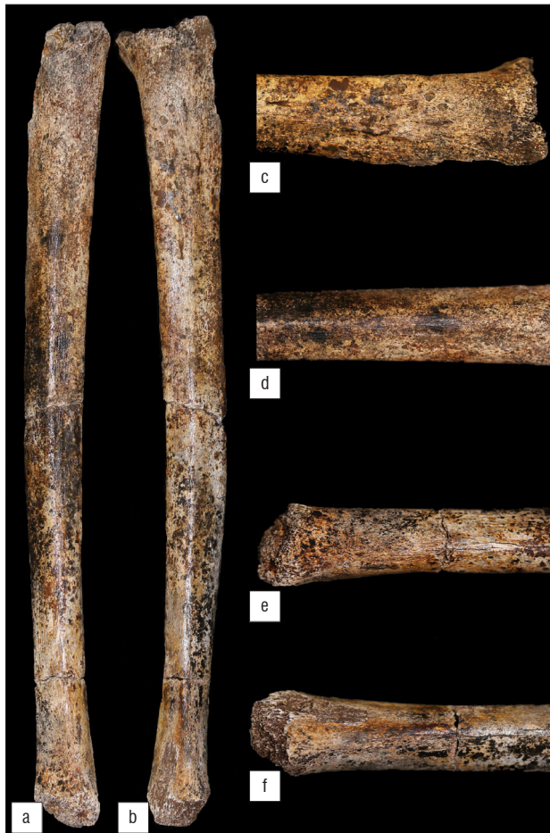
(a) Medial aspect; (b) lateral aspect; (c) close-up of anterior shaft; (d) mid shaft; (e) close-up of distal end seen in (a); (f) close-up of distal end seen in (b).

However, the distribution of Mn staining is not only on this one side of the specimen, but on all anatomical sides (anterior, posterior, medial and lateral), as shown in Figure 1. Such a distribution can also be seen on many specimens (for example, in Figure 2, specimen U.W. 101-1070, correctly attributed here). The distribution of Mn staining on the Dinaledi Chamber material is generally circumferential, occurring on multiple sides of bones. That distribution is not compatible with lichen growth in the present context, and there are significant reasons to reject the hypothesis that the Dinaledi Chamber is a secondary deposit. 2,13