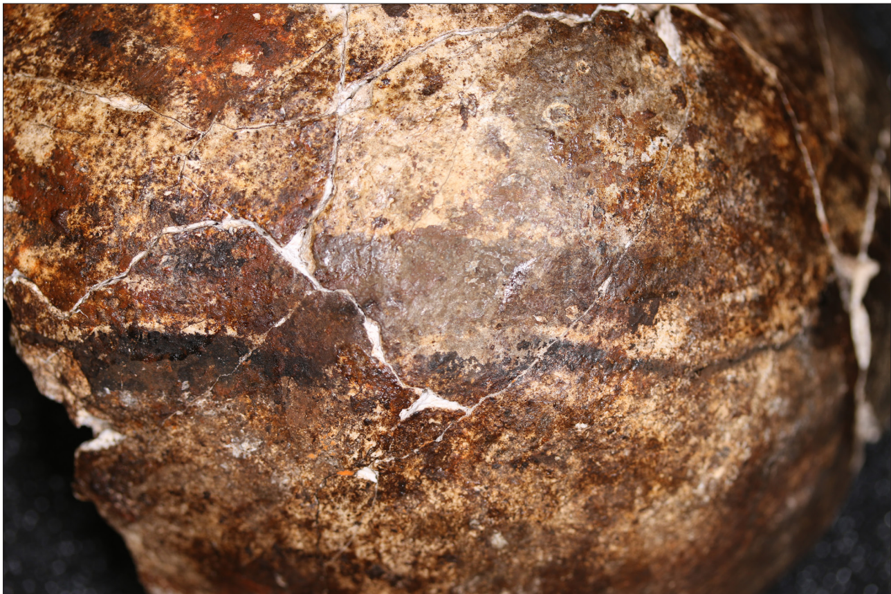
Figure 3: Specimen U.W. 101–419 Cranium A(1) displaying tide lines of mineral staining which extends across different vault fragments. Tide lines mark a contact boundary between the bone surface and surrounding sediment, and indicate the resting orientation of the bone during precipitation of the stains.

Thus the notion that snails are light-dwelling, leaf-litter feeders is incorrect, and bone surface modification by snails cannot be used to imply a close entrance to the surface or redeposition of the hominin fossil material from a location near light. Furthermore, much of the radula damage observed on the bones of H. naledi occurs after they were mineralised – therefore most invertebrate damage was probably produced inside the dark Dinaledi Chamber on bones already covered in coatings of manganese and iron oxide deposits (Figure 4).