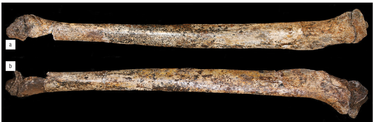
Figure 2: Patterns of mineral staining affecting tibia U.W. 101-1070. Note differential mineral staining patterns between conjoined fragments at the distal end.

In addition to lichen, Thackeray suggests 1(p.5) that snails and beetles could indicate the presence of leaf litter (on which they feed), which would be found near the cave entrance and therefore in a situation with diffuse light. However, as noted by Dirks and colleagues 13 , snails have been recognised to colonise dark caves to considerable depth 17 , and are far from restricted in diet to just plant matter 18 . Gulella sp. and Euonyma varia (Connolly, 1910) occur in large numbers in the Rising Star Cave system, including in deep chambers in the dark zone, and may well be responsible for some of the bone surface modifications on the fossils. Subulinid snails (including Euonyma ) are largely omnivorous and are thus not dependent on green plant material as a food source (Herbert D 2016, personal communication, January 28), while Gulella spp. are carnivorous and feed mostly on other snails. 18